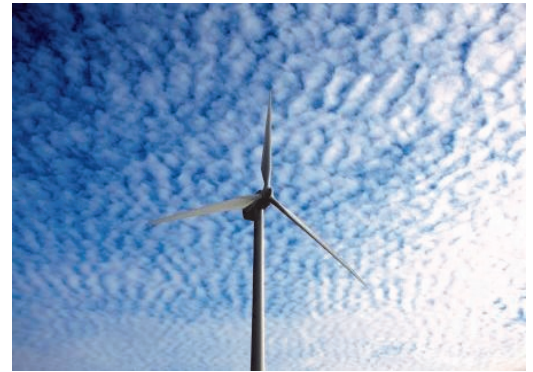
Hydro Tasmania, a leader in wind and other renewable energy technologies

It quickly became obvious that trying to locate the right data from SAP or SAP BW was a major hurdle which affected the BI team's ability to meet deadlines and was resulting in a growing backlog and potential damage to their internal reputation.