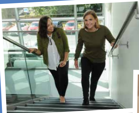
"It's very important for my future work because I have learnt a lot of social skills."