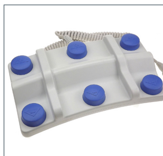
imagiQ2 foot control Compact multipedal footswitch for discrete placement beneath the table with soft touch buttons and a light operating force. Article code: 535-1762