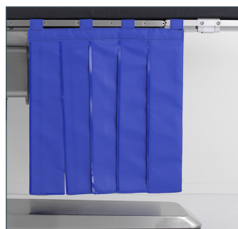
imagiQ2 radiation shields Tailored and easy to fit protection against scattered radiation with lead rubber (0.5 Pb) material. For detailed information please see our brochure for Radiation Shields.