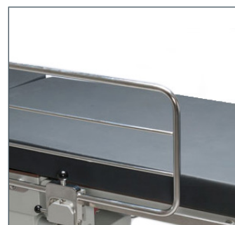
Side gates ERCP Side rail mounted gates to ensure the patient's safety and comfort during ERCP procedures. Article code: 514-100530 (pair) Require: Side rails 535-1721 (USA/LATAM: 514-100530-US; require: Side rails 535-1720)

The imagiQ2 offers a wide range of accessories for vascular, ERCP, pain management and electrophysiology; and it can be upgraded with features to adapt to surgical needs.