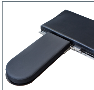
Translucent fistula arm board Provides an unobstructed image and is connected directly to the carbon fiber top for Vascular procedures. Article code: 535-1730