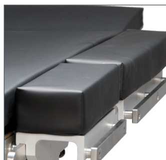
Widening sections ERCP Side rail mounted side extensions, length 455 mm, with mattresses, for procedures involving lateral positioning of the patient. Article code: 514-100422 (pair) Other dimensions available upon request. Require: Side rails 535-1721 (not available in the U.S.)