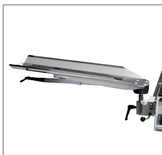
Universal adjustable arm board Nontranslucent board provides ideal support for the patient's arm during IV. Article code: 514-50-3SR025 (USA/LATAM: 514-50-3SR027)