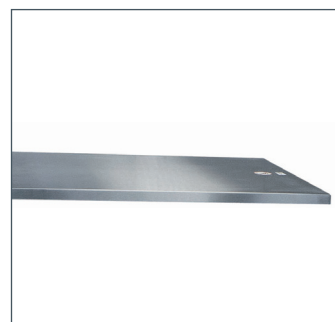
Catheter tray (Vascular) Provides an extended work space, which is attached directly to the table. Available in three lengths. Article codes: 500 mm: 535-1752 1,000 mm: 535-1750 1,500 mm: 535-1751