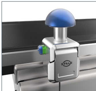
Extra pan handle Extra pan handle allows panning the table from different sides Article code: 535-1760 (USA/LATAM: 535-1761)