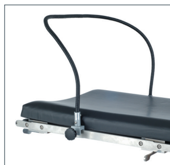
Anesthesia frame Provides a sterile barrier separating the surgical field from the patient's head. Article code: 514-100311 (USA/LATAM: 514-100311-US)