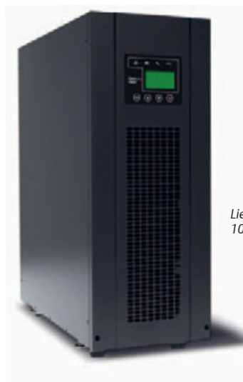
Liebert GXT3 10000 VA Tower