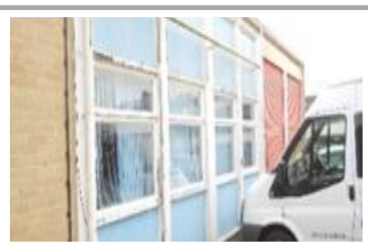
Yeovil Fire Station (Before)

After a slightly quiet start to the year, largely, I feel, due to the weather, I'm very pleased to report that we are now very busy materials that are destined for group orders