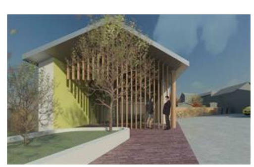
Artists impression of Hospicare in Honiton

Works at St Luke's Hospice are on-going, both to programme and budget and are due for completion and handover in June, with the new Day Care