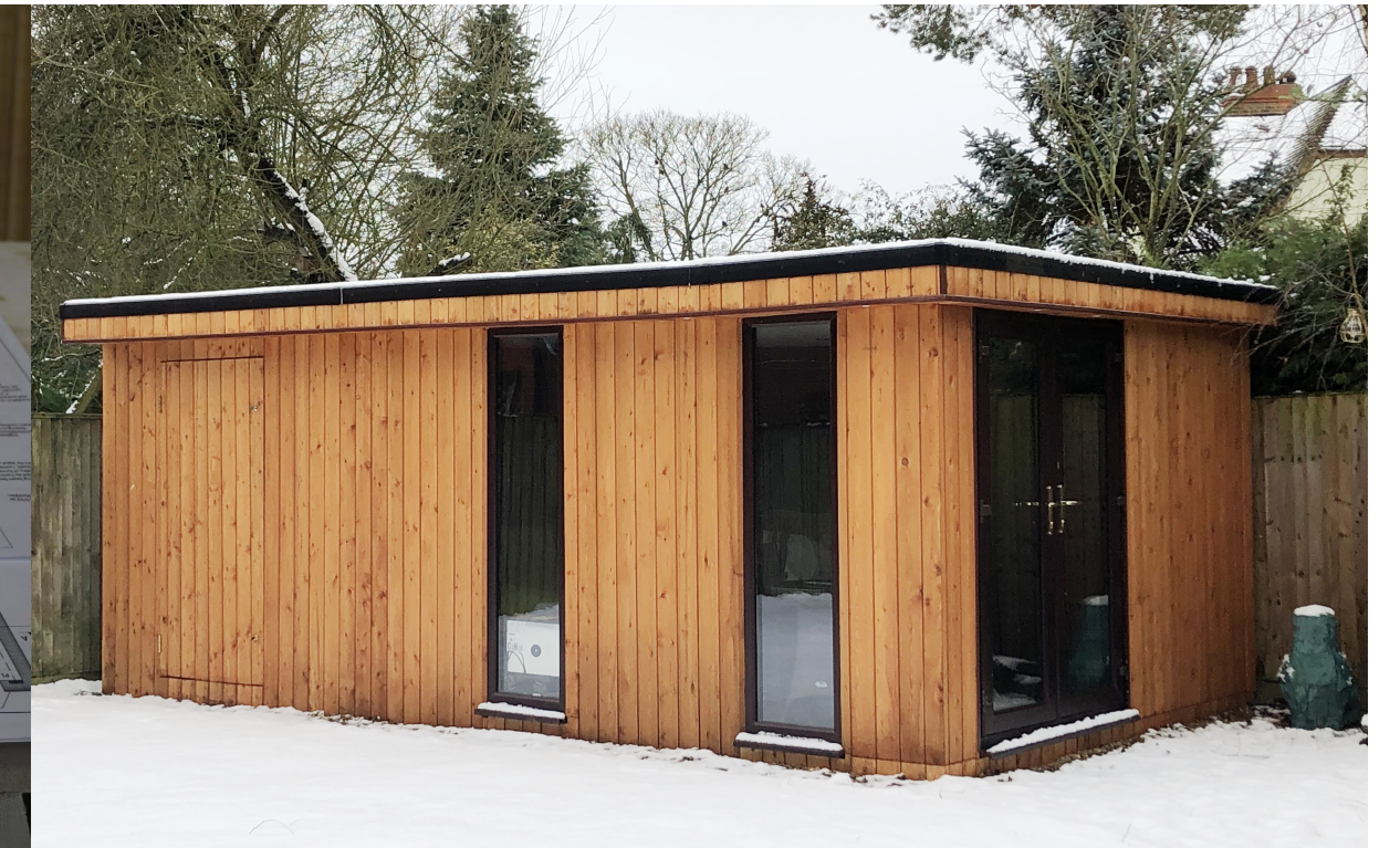
(Then we build your dream Garden Spot)

Book your free site survey and consultation today!