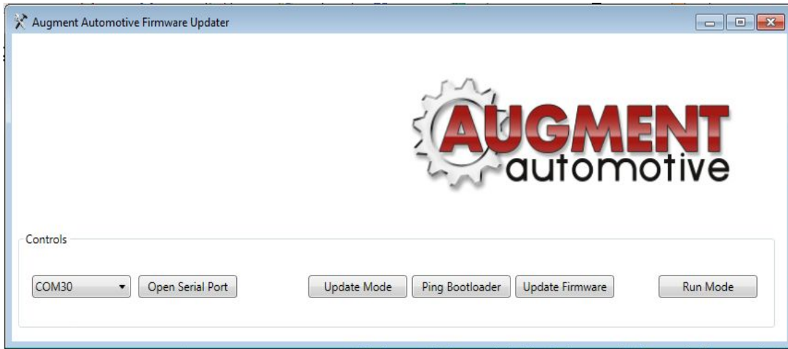
Figure 1: Augment Automotive Firmware Update Tool

Once the tool is running and the laptop is connected to the device the correct com port should be selected from the drop down list on the left and the 'Open Serial Port' button pressed.