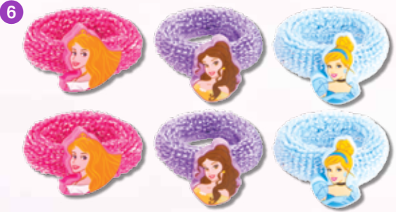
1 491687U Headband Pink plastic glitter injected headband with plastic heart charm featuring Cinderella, Belle & Aurora