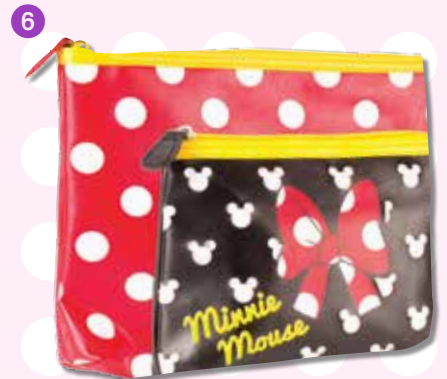
3 491546U Organiser

Pastel green animal print PVC cosmetic bag with pastel pink PVC trim, featuring a Minnie Mouse with glitter finishes and matching pink zip closure with silver heart zip puller Size: L20 x W10 x H13cm