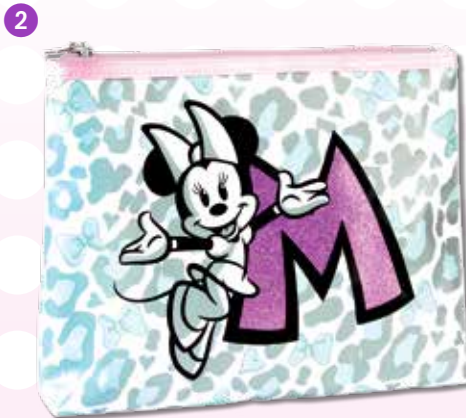
2 491547U Flat Wash Bag

Pastel pink PU train case with pastel green animal print trim, featuring Minnie & Mickey print with diamante embellishment and a silver heart zip puller Size: L22.5 x W14 x H14cm