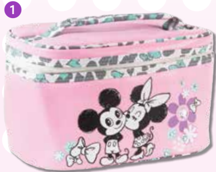
1 491548U Train Case

Pastel pink PU train case with pastel green animal print trim, featuring Minnie & Mickey print with diamante embellishment and a silver heart zip puller Size: L22.5 x W14 x H14cm