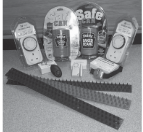
A selection of the items available to buy from the Banff & District Community Safety Group.