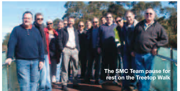
The SMC Team pause for rest on the Treetop Walk

We're getting hungry just thinking about next year's NAIDOC Week!