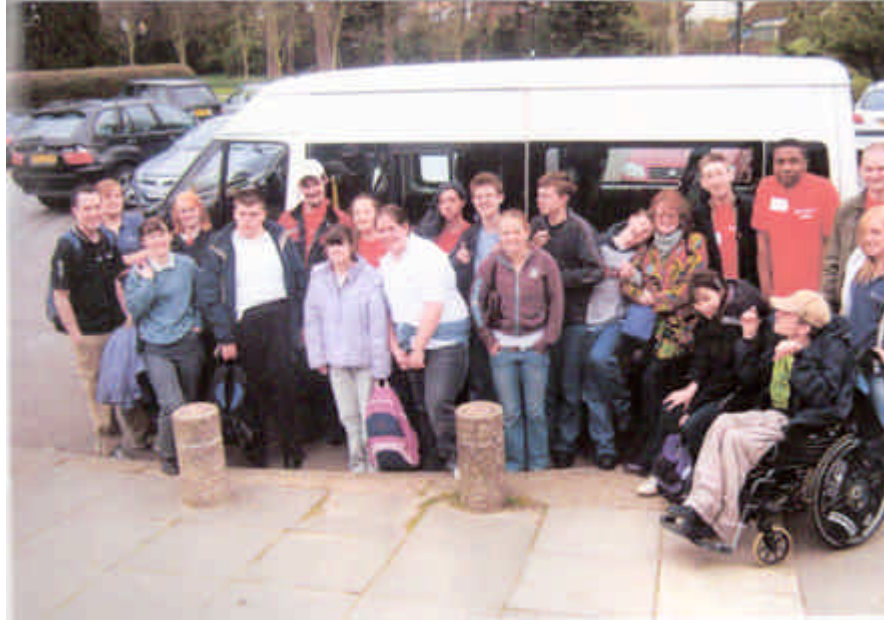
Horsham Princes Trust Team 33 are pictured here with staff and volunteers outside Horsham Superbowl and our Activities minibus after an exciting day with the Outburst youngsters

We were also very fortunate to have a whole Easter 'events day' organised for Outburst by the Horsham Prince's Trust Team 33, who are a group of disadvantaged young people participating in a motivational and team building project. Everyone in the group said that they had a really good day and it was great to be able to give the Prince's Trust Team some well deserved positive feedback.