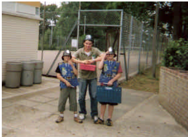
...as well as arresting their hard working volunteers!