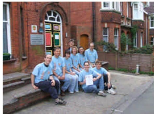
Our annual visit from the "Lets Go 2007" team (with their certificate) was once again very welcome and they all put in another sterling week- long effort painting the exterior windows, first floor office and tidying the Jubilee Leisure Garden