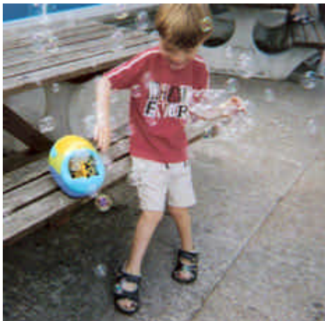
The Grasshoppers children enjoy a range of fun and sensory experiences during the playschemes

At Easter the warm weather gave the children plenty of opportunities to play outdoors including a fun cricket sports session facilitated by Horsham Leisure Link. There was an almost continuous session of making chocolate Easter egg nests and we were also very fortunate to have a huge donation of chocolate Easter eggs from the Radio Mercury's Easter Appeal, so all the children had a very difficult decision in choosing which one to take home with them. We were also able to make two visits to Holmbush Farm World in our new minibus, with one member of the group witnessing the birth of a new lamb!