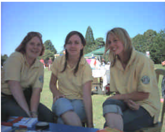
The staff from our local Starbucks coffee shop gave us excellent support by volunteering for our "Festival of Inclusion" stand at Horsham Park in July 2006. With their help, we were able to provide a range of attractions including face painting and "Hook a Duck"

We enjoy and appreciate the help that local organisations provide with volunteering teams during the year and their valuable assistance with our fundraising efforts. Our thanks go to Collyers 6 th Form College, EMS, Heath Lambert Insurance Services, Horsham Rotary Club, Let's Go Campaign, Novartis, Royal & Sun Alliance, Starbucks Horsham, Tanbridge House School Year 11 and Sussex County Cricket Club. This list exemplifies how widely our volunteering net is cast and we thank everyone concerned for giving their free time and talents for our organisation.