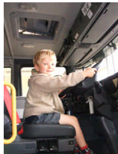
Our friends at Horsham Fire Service once again offered the Twins Club a visit to their station to enjoy trying out their fire engines and equipment