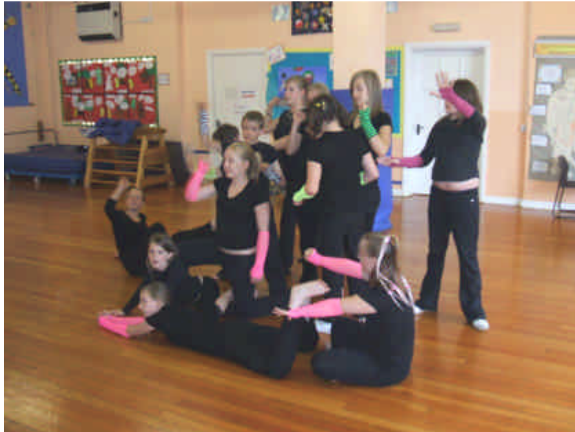
Step-by-Step were recently involved in a Dance Concert at the Capitol Theatre in Horsham. Here the group are busy rehearsing for their performance.

Step-by-Step has been part of the Project for nearly five years and meets every Monday during term time in Cowfold from 5.30pm - 6.30 pm. They are always pleased to welcome new members and volunteers to help with the dance sessions. There are 20 youngsters who regularly attend - all needing additional support - together with a group of eager young volunteers who partner them for the hour and provide their parents a valuable but productive short respite break.