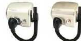
MG88HT (l) LEM MG88HT (s) LEM