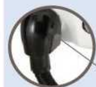
Nozzle with skincare protection

Anti-vandal and anti-theft, high-performance warm air hair dryer, equipped with flexible hose. Sturdy structure made of carbon steel with anti-writer (special treatment that allows easy cleaning of the surface) available on the black and white porcelain version, alternatively stainless steel AISI 304 in satin or bright version. Equipped with SKINCARE & WATER STOP safety devices, Electrical protection level: Class II. Long life motor equipped with LEM patented system which allows fast and easy maintenance. Matching with single or multiple coin box for paying service and with the sliding rail for height adjustment.