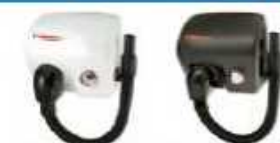
MG88HT (b) LEM MG88HT (a) LEM