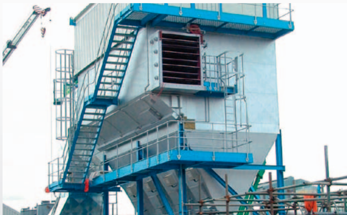
ANIMAL MEAL COMBUSTION