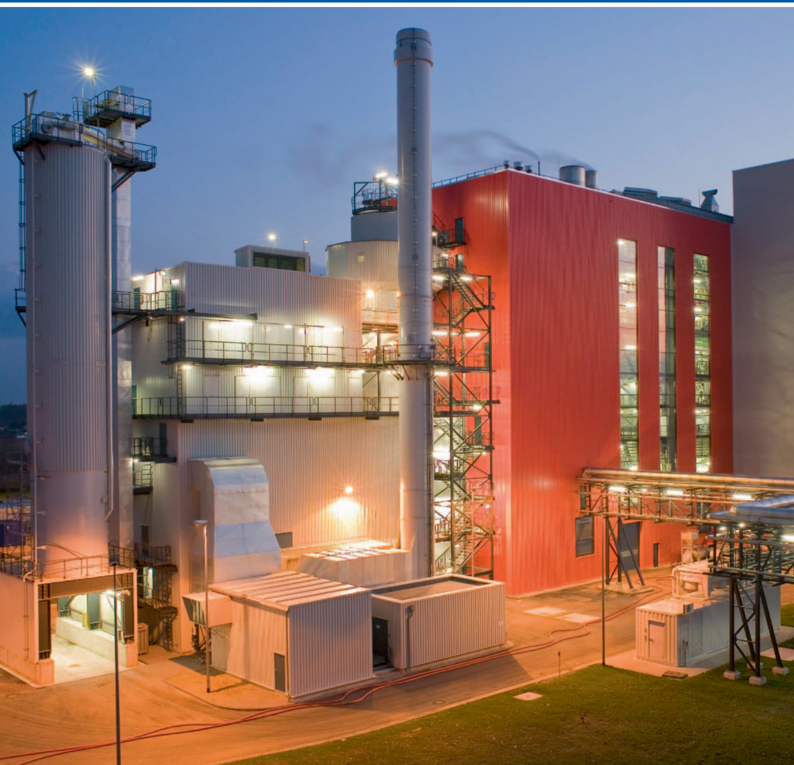
Incinerator for RDF

... MORE THAN 70 YEARS OF WORK EXPERIENCE GATHERED FROM THE CONSTRUCTION OF AIR POLLUTION CONTROL PLANTS