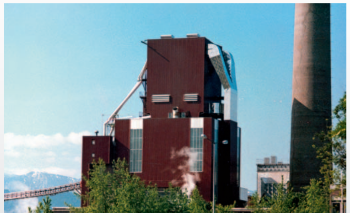
VORTEX BED FOR SLUDGE, BARK AND ADDITIVES