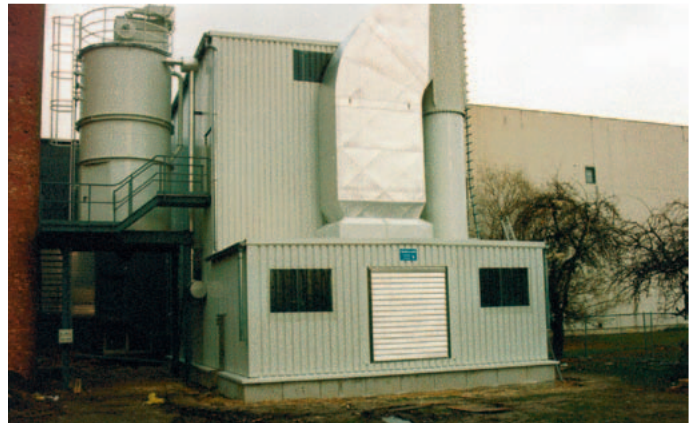
FIRE TEST STANDS