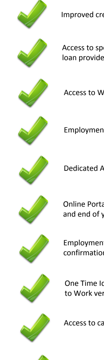
Improved credit rating.