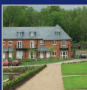
Holy Cross Priory Page 3