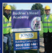
Buckler's Mead Academy Page 5