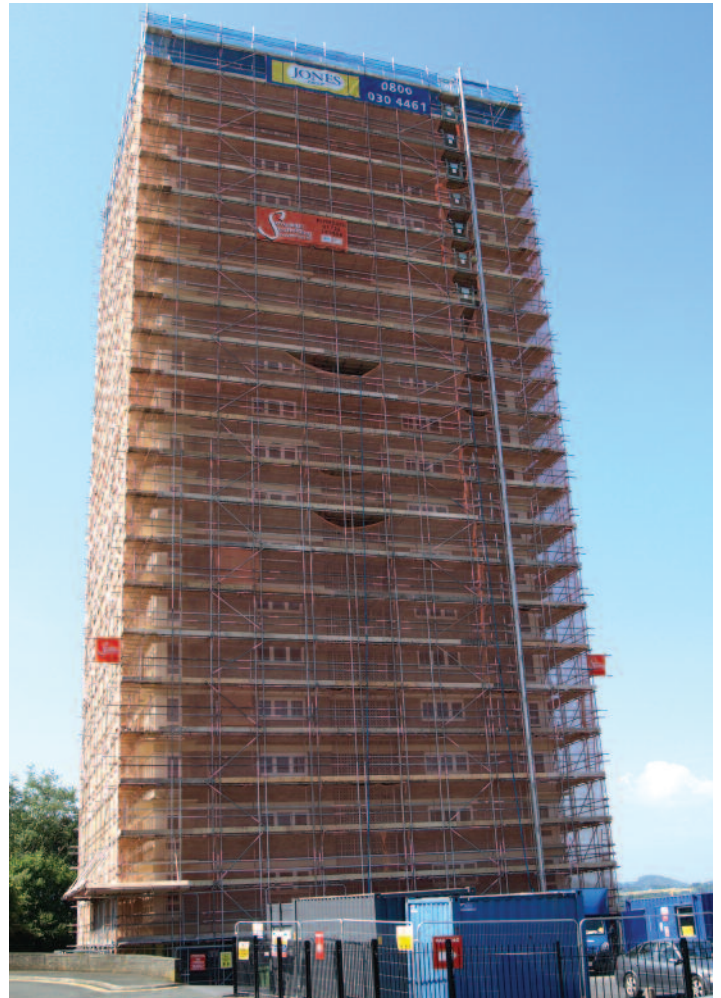
Chichester House, Hastoe Housing Association redecoration

We have just signed up to another 12 months for reactive maintenance,