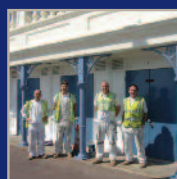
Sunshine Painters Weymouth Page 4