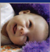
New arrivals at Jones! Page 2