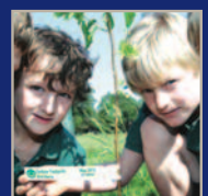
ISO14001 Page 8

...Enjoy your Holidays from all the directors and management at Jones Building Contractors