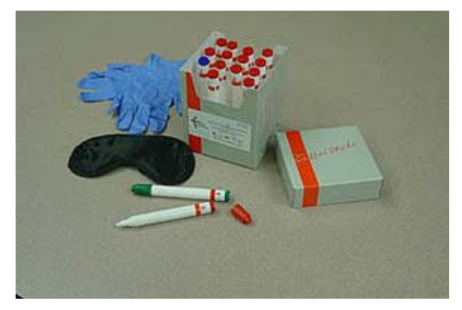
Figure 2. The St. Croix Sensory Odor Pen Testing Kit, manufactured by Burghart. Included in the kit are a blindfold, latex gloves, and the set of 14 odor pens (red) and two blank pens.

In the routine clinical evaluation of patients with olfactory disorders, one commercially available psychophysical testing method is known as Sniffin' Sticks, shown in Figure 2. Sniffin' Sticks, manufactured by Burghart of Germany, are non-dispensing felt tip marker pens. One nasal chemosensory testing mode can determine a person's odor threshold based on the standard odorant 1-butanol.