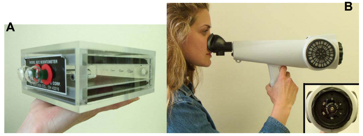
Figure 3. (A) The Scentometer Field Olfactometer (Barneby Sutcliffe Corp.). Note the two glass nostril ports to the left and the series of orifices at the back of the unit to the right of the photo. (B) The Nasal Ranger Field Olfactometer (St. Croix Sensory). The inset picture shows the orifice dial, which is located at the right side of the Nasal Ranger in this photo.

Two commercially available field olfactometers include the original Scentometer (Figure 3A) and the Nasal Ranger® (Figure 3B), introduced in 2002 (McGinley, M.A., 2003; McGinley, C.M., 2003).