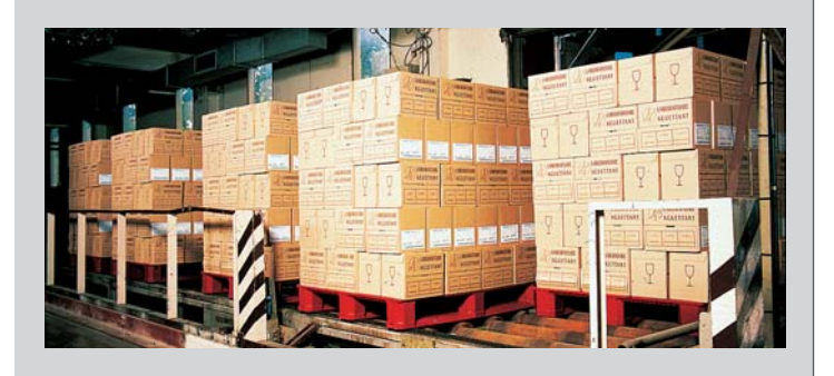
Automised handling : compatible with all handling equipment from conveyor packing to high bay racking.