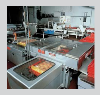
Bakery : for confectionery, bread rolls and loaves: hygiene and protection from baking to bakery.