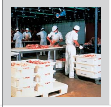
Meat processing : hygiene and protection in every stage of meat handling and distribution from boning to butchers.