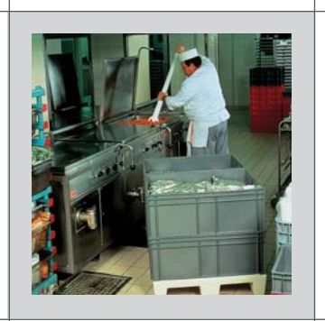
Catering : bulk handling of ingredients and ultimate hygiene from kitchen to customer.