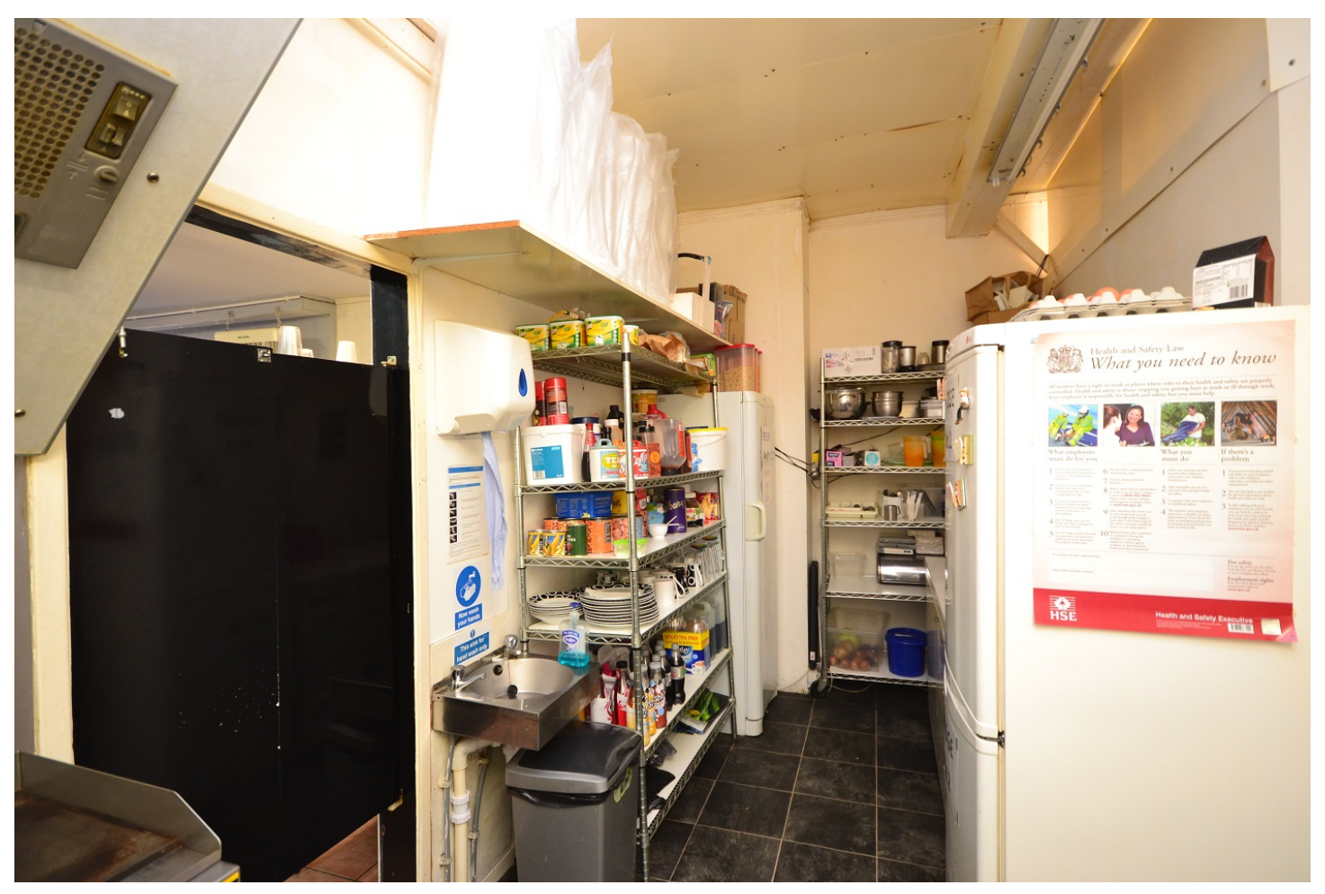
KITCHEN STORAGE AREA