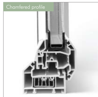
Shown with thermal sleeve insert.