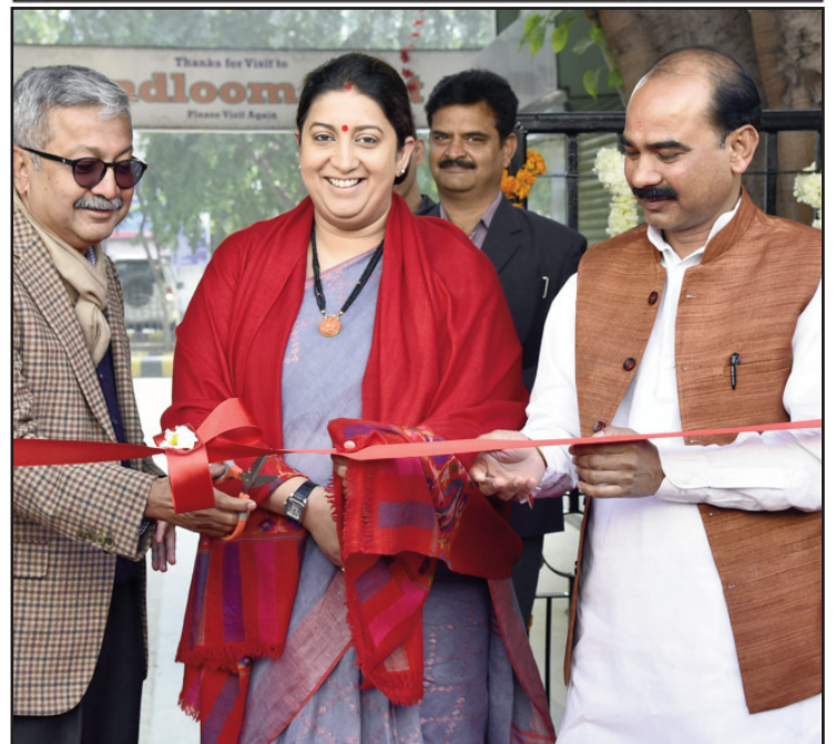
The Union Minister for Textiles, Smt. Smriti Irani inaugurating the Refurbished Handloom Haat, in New Delhi on March 05, 2019. The Minister of State for Textiles, Shri Ajay Tamta and the Secretary, Ministry of Textiles, Shri Raghendra Singh are also seen