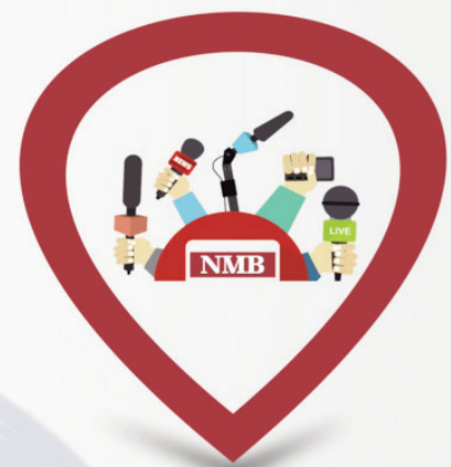
Newstree Media Broadcasting Pvt. Ltd.