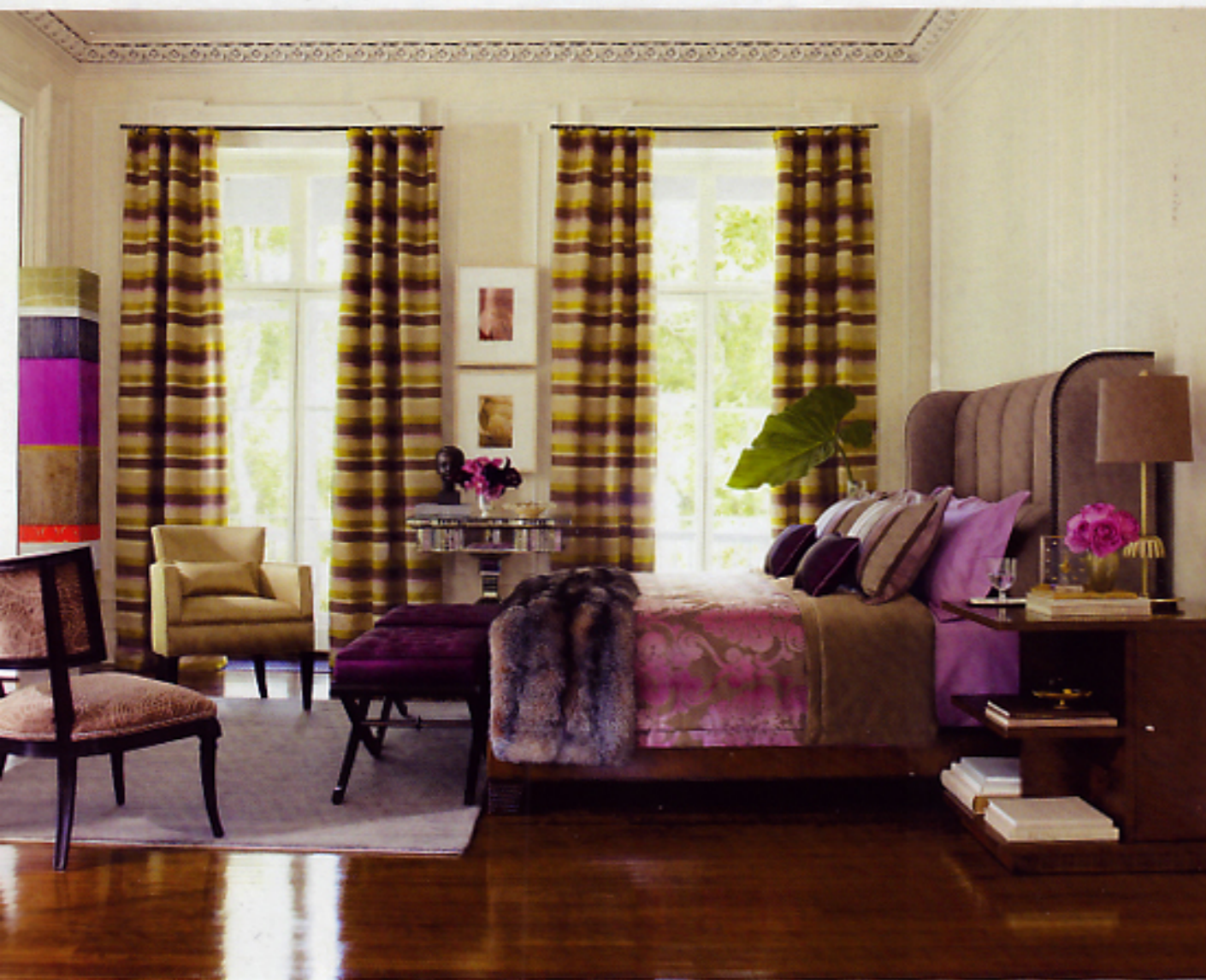
Above: A vibrant bedroom vignette by Robert Allen plays with purples and neutral tones and textures.