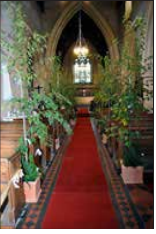
FREE Newsletter to Suckley Residents