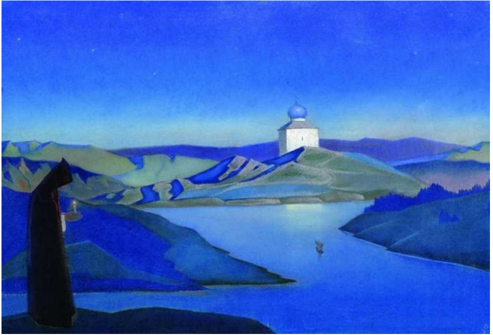
“Twilight” by Nicholas Roerich