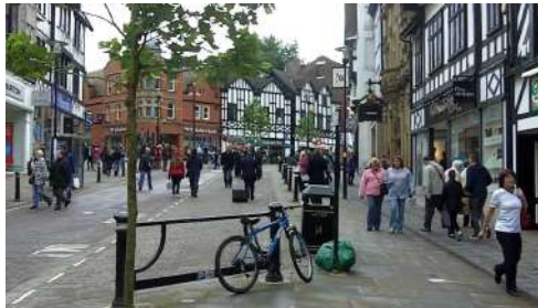
Wigan Town Centre

didn't look at in our American comparison was total product time. The 1600 hours invested by the owner earning his car may be devastating to his life's time budget, but what about everyone else's? That