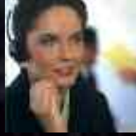
24/7 Response Centre