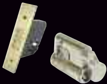
eMAKS Mortice Deadlocks and Sash Locks