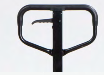
Three position fingertip control lever