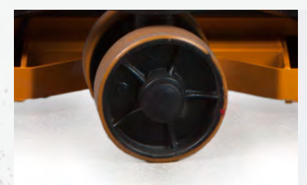
Polyurethane steer wheels and load rollers