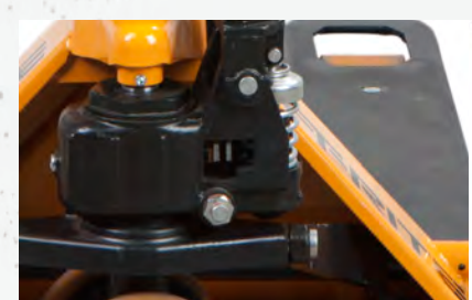
Greaseable bushings ensure a long service life