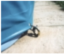
Cable Anchor system (requires solid fixing points)