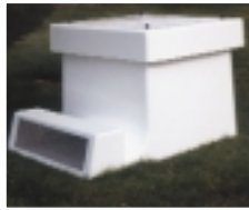
Inflation fan (in weather proof housing)