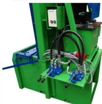
Two Handed Safety Controls