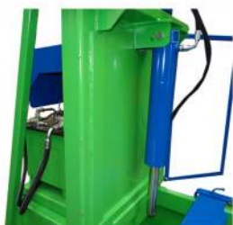
Grease Fittings Provided for Lubrication