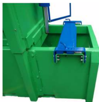
Adjustable base for different tyre sizes