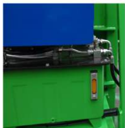
Oil Level Gauge