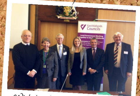
With leaders of councils from across the East Midlands