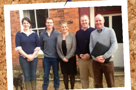
Speaking about CAP Reform with the NFU in Great Easton