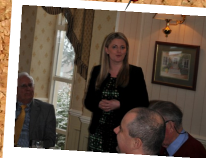
At my European Information Lunch in Kegworth, Leicestershire