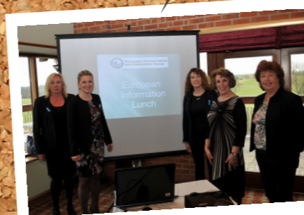
At the CNO Conference in Derbyshire