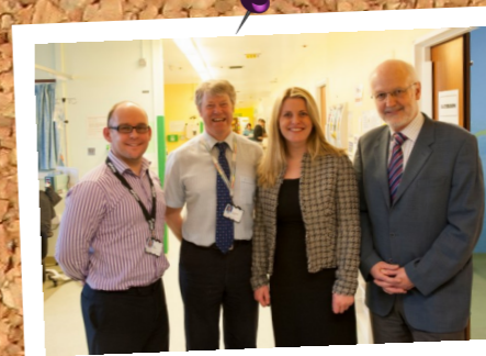
Discussing clinical trials at the Children's Brain Tumour Research Centre in Nottingham