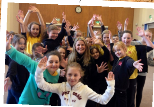
Visiting the Majestic Theatre Group in Retford