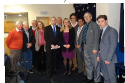
Great debate at the Northampton South CPF event in February.