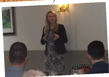
Speaking at a Europe CPF lunch in Bassetlaw, Nottinghamshire.