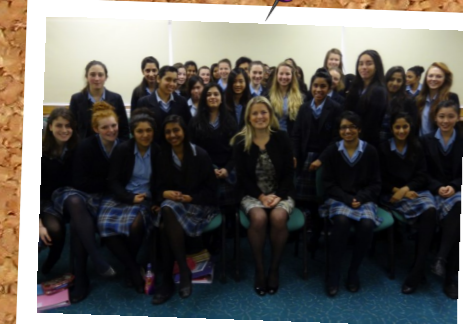
At Leicester High School for Girls earlier this year.