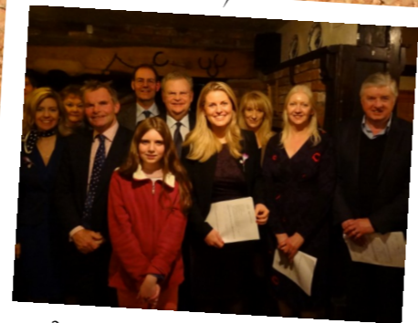
With members at Lincolnshire Conservative Policy Forum