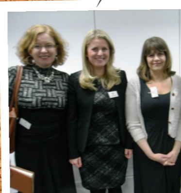
At a 'Women in Politics' event in Nottingham earlier this year.