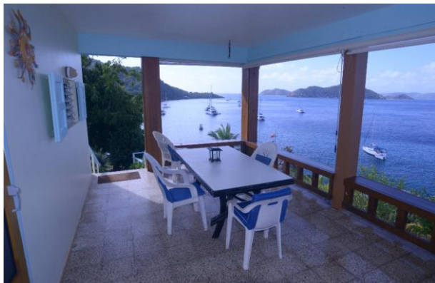
Open Air Dining

The house is arranged as two distinct living areas joined by the front porch and courtyard and is perfect for three couples, two couples with children or a single large family. The highlight of this house is the Open-Plan Main Living area on the front porch. The open-air dining and living room area provide dramatic views of Manchioneel Bay and the Sir Francis Drake Channel.