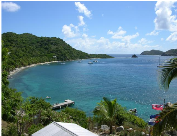
Manchioneel Bay, Cooper Island, BVI

Relax, swim and snorkel/scuba dive, read, or watch daily life at Manchioneel Bay. This small piece of paradise provides island living at its best. Our 50ft Open-Plan Living Area and west-facing panoramic view showcase spectacular sunsets over Tortola and the Sir Francis Drake Channel. Experience self-sufficient island living without giving up all the amenities.