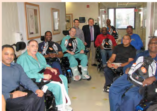
United Spinal and VetsFirst staff visit veterans at the James J. Peters VA Medical Center.