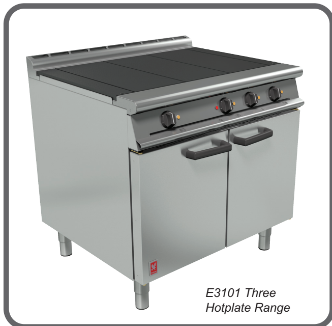
E3101 Three Hotplate Range