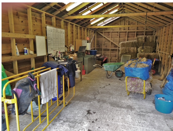
Our Barn before!