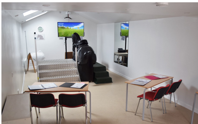
What a transformation — Amazing!