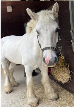
Top/down: Wally, Bill, Barney

The past few months have seen some great changes at Gaddesden, with Barney and Wally gradually joining the team in sessions after a period of time settling in. They are both doing really well, taking at least a session a day with Wally doing slightly more - we still have some work to do with certain areas such as mounting from the lift or hoist but these things will come; we've only had them about 4 months so the progress so far is brilliant.