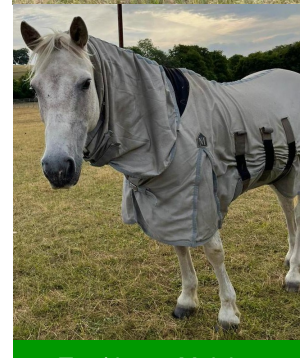
Top/down: Melvin, Bramble, Blue

However, after doing this Bramble has really improved both mentally and physically - his sparkle is back, his coat is shining and he just looks/feels better all round. So, we have amended our decision and he will be semi retiring, meaning he will stay with us, doing one session maximum a day, combined with staff schooling and hacking out round the estate. As this clearly is an arrangement he likes, this gives us time to search for a new pony but without putting extra stress onto the rest of the team.