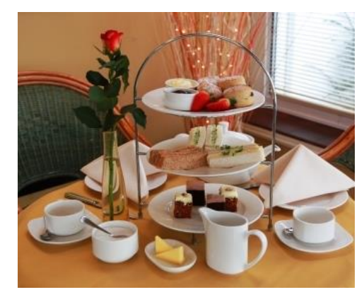
We offer a wide range of catering for all tastes and appetites.

The following options are suggestions only – we would be happy to discuss your precise requirements with you.