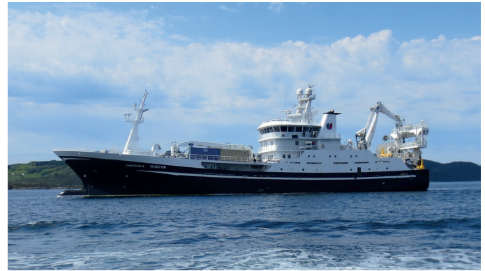
MV Christina E