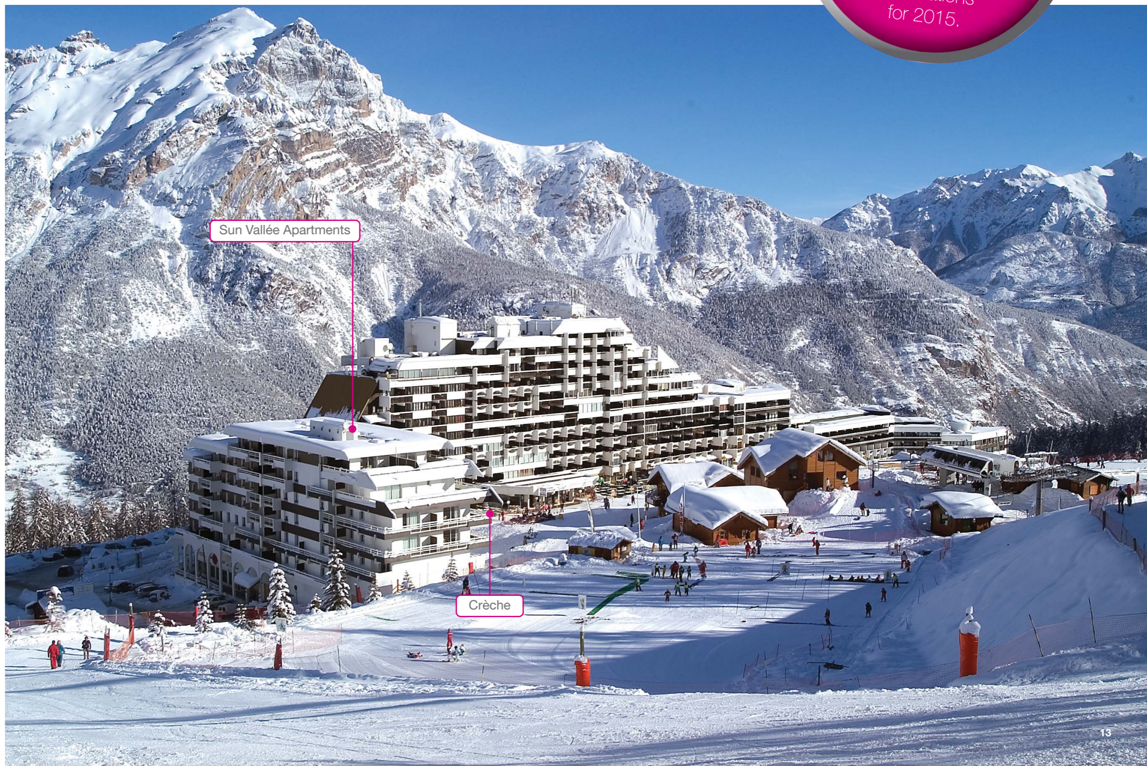
Sun Vallée Apartments

Please book early - by the time you receive this brochure many 2014 dates are full. We are already taking advanced registrations for 2015.