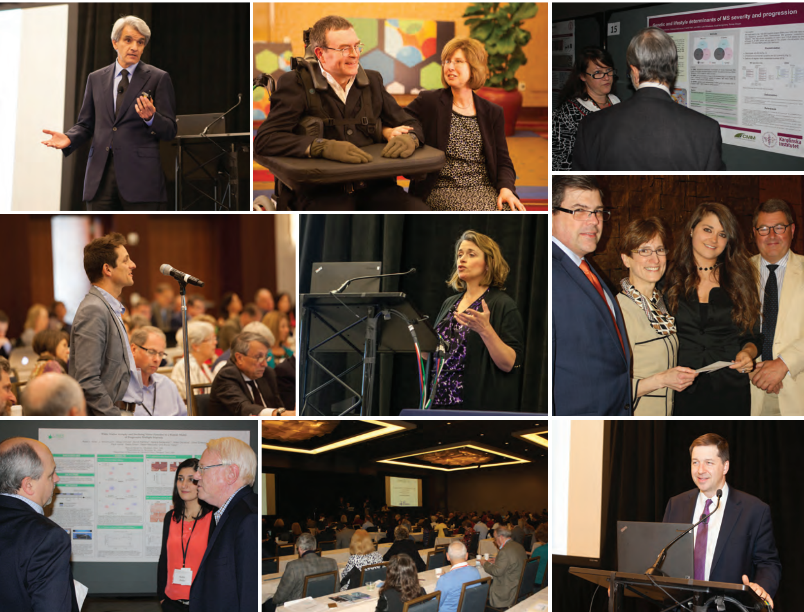
Researchers from around the globe came together in 2016 for the Second Scientific Congress in San Francisco, CA.

The Alliance aims to change the landscape of progressive MS more quickly by developing new tools and methods to streamline drug discovery. Remaining focused on our priorities will enable new treatment discovery, while reducing the time and cost of testing potential treatments. This, in turn, will accelerate access to treatment for people with progressive MS.