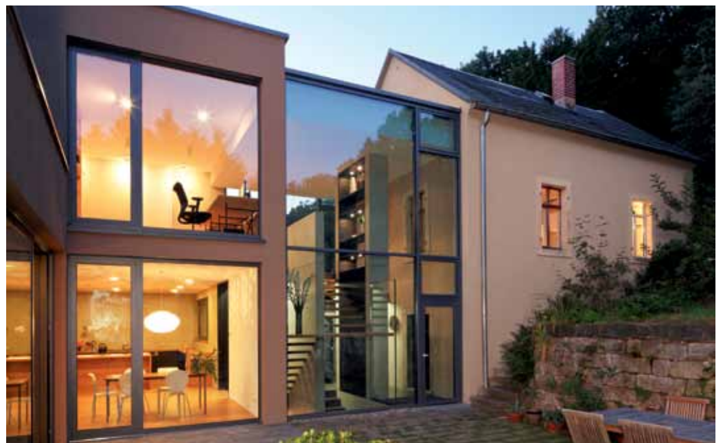
Schueco glazed façades will add drama to your home