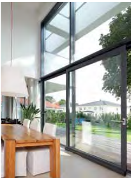
A Schueco tilt-slide door has a low threshold

As soon as you open a Schueco sliding door – whether it's a straight slide or a tilt-and-slide system – you know you're dealing with quality. The solid feel of the frame and the effortless ease with which it glides open make that instantly clear.