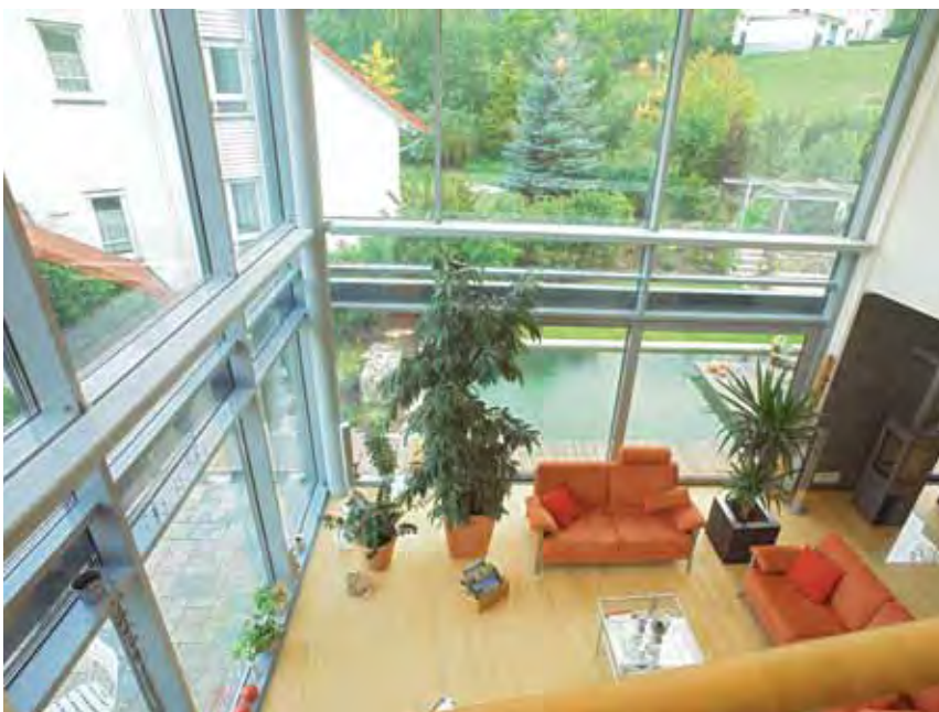
Precision-engineering at its best

This means that you can enjoy the drama of a large glass façade while still staying warm and comfortable on cold winter days.