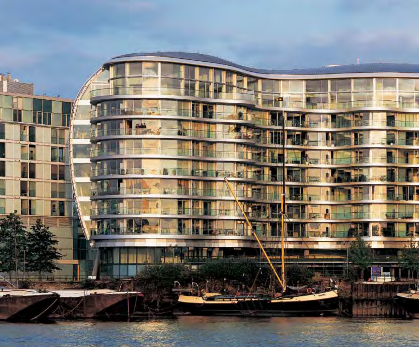
Albion Riverside, London, designed by international architects Foster + Partners and featuring Schueco systems

The systems we produce for the residential market are only one part of our business. Founded in Bielefeld, Germany, in 1951, we are a global company responsible for the aluminium façades, windows and doors on many of the world's most prestigious buildings.