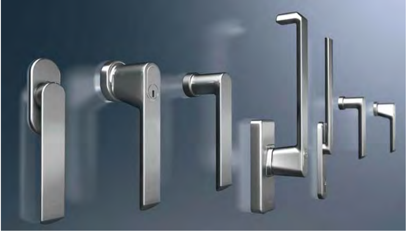
Minimalist design and a range of finishes give Schueco handles for windows and sliding doors their timeless appeal