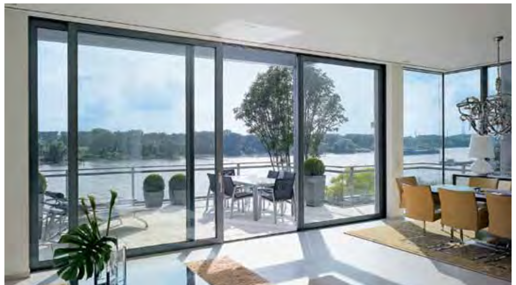
Slide a Schueco door open to enjoy more than the view