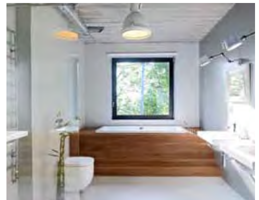
Every window makes a statement

With so many types – inward-opening, outward-opening, side-hung, top-hung, tilt-turn or fixed light – there'll always be a window to meet your needs. And it will offer excellent 'U' values, a smooth operation and tight, draught-proof weather-seals.