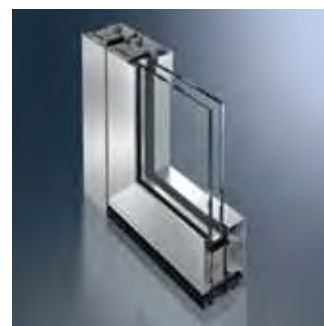
The Schueco ADS 75.SI entrance door