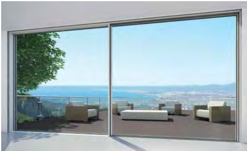
A panoramic sliding door lets you see the bigger picture

What's the best way to bring a house to life?