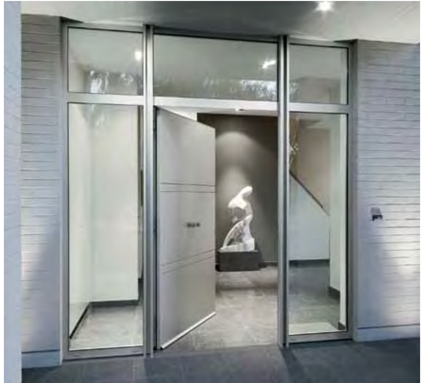
Customise your Schueco entrance door with stylish infill panels

When you visit someone's home, do you ever consider the front door and what it says about the owner? Many of us do, recognising that a front door is not simply a functional item, but also an important indicator of taste.