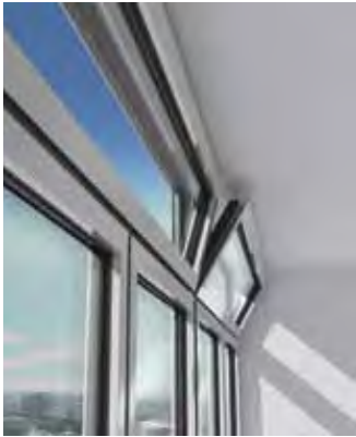
No more stretching to open fanlights