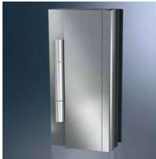
Slim-line barrel hinges with concealed fixings merge seamlessly into the profile