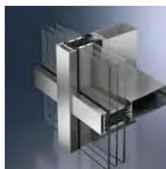
The Schueco FW 50°.SI façade