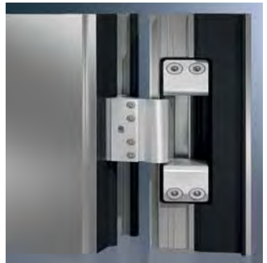
Completely concealed door hinge also offers excellent weather protection

Today's world is anything but certain, so one of our priorities is to ensure that your home always feels safe and secure.