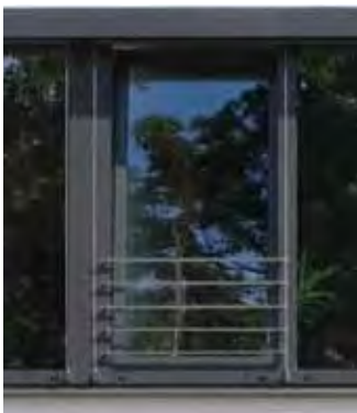
Metal balustrades add style and balance

What's more, to get a sophisticated continental look, why not opt for metal balustrades or glass safety barriers?