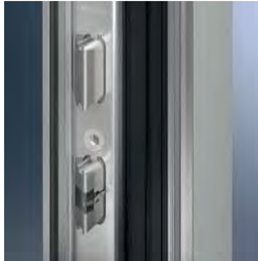
Schueco SafeMatic lock offers convenience and security