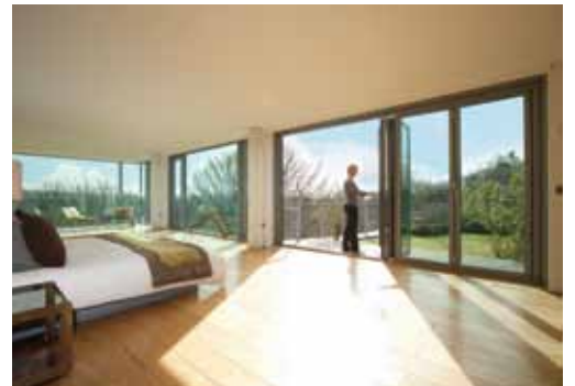
Slide it back on its precision rollers ...