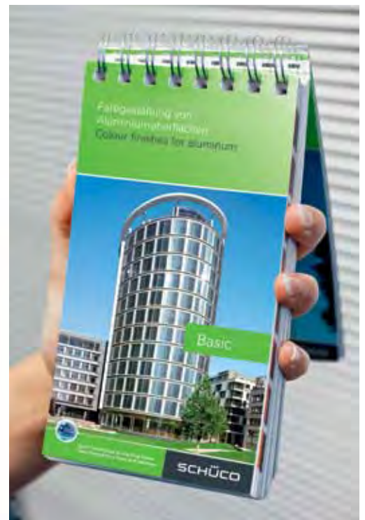
Real choice from the Schueco colour range