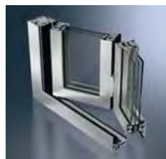
The Schueco 80 FD.HI folding door with triple-glazing