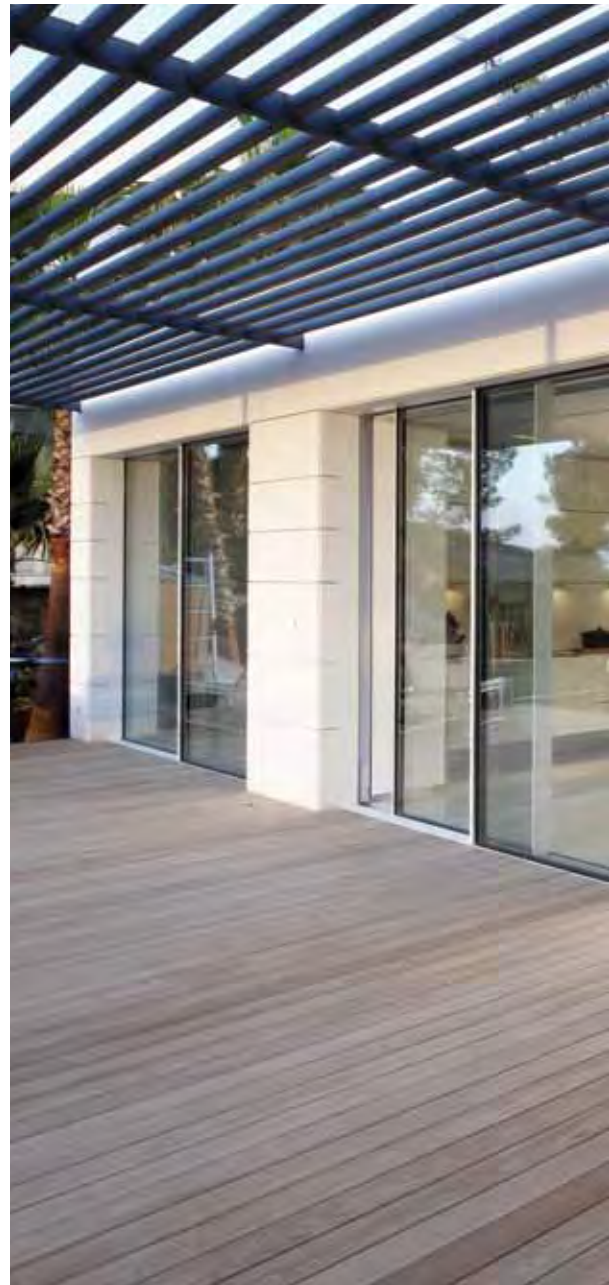
Panoramic sliding doors are your window on the world

With access made particularly safe by a threshold which lies completely flush, these beautiful sliding doors are as functional as they are stylish.