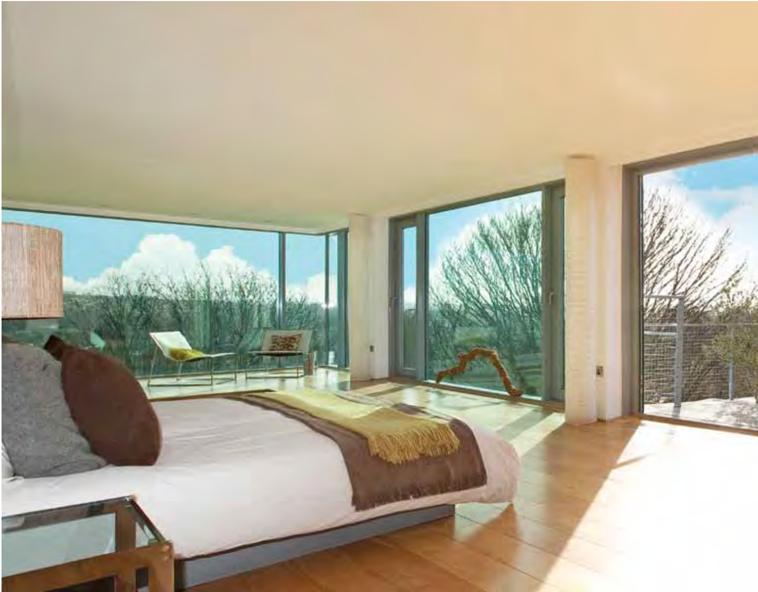
Enjoy a fabulous open air experience

Everyone loves being in the open air when the sun shines.