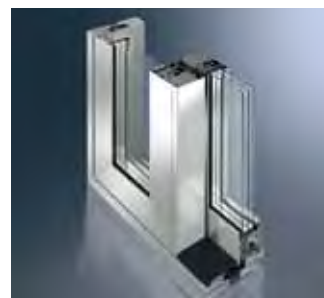
The Schueco ASS 70.HI sliding door