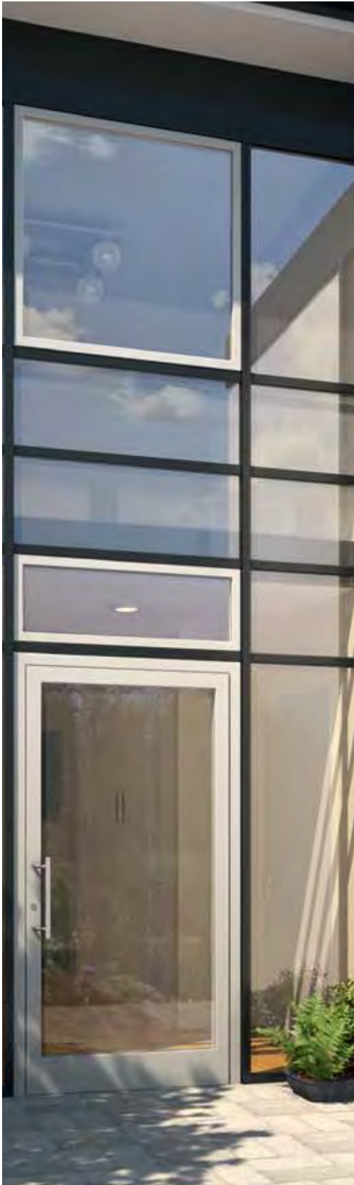
Elegant and secure – that's a Schueco entrance door