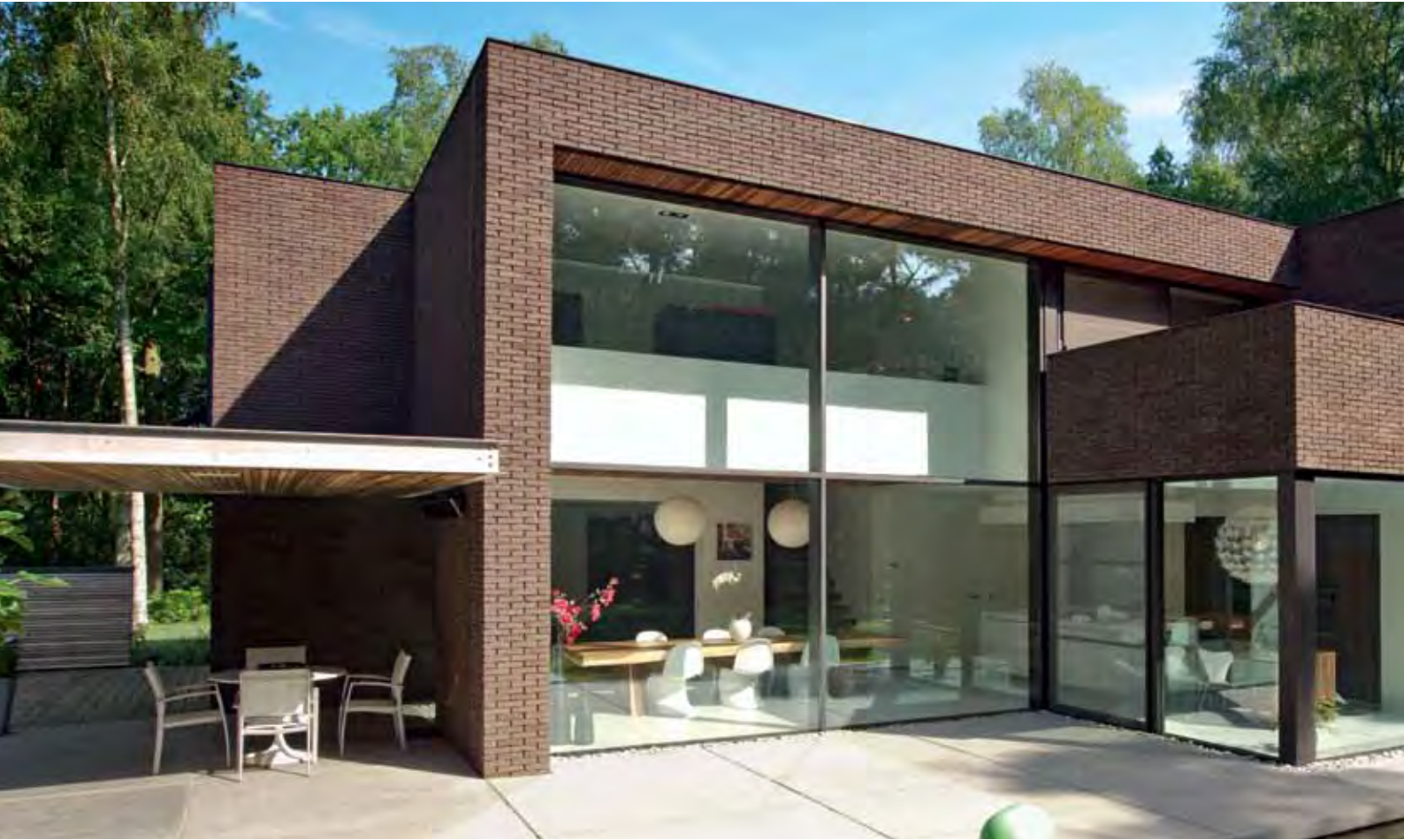
A stylish and contemporary look, courtesy of Schueco