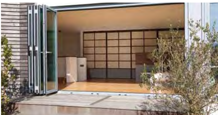
Welcome in the garden with a 95% clear opening