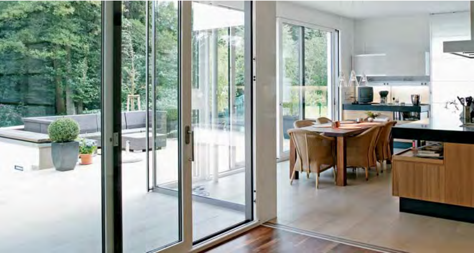
Let a Schueco sliding door bring light into your life