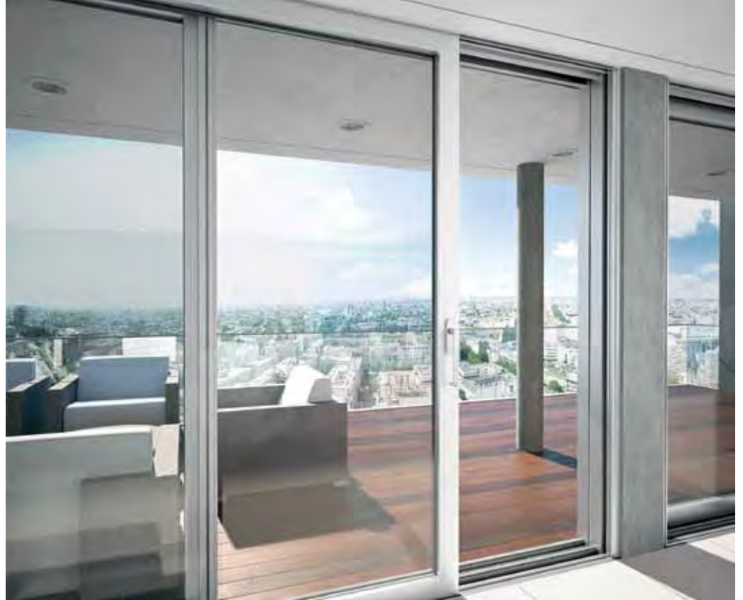
A Schueco super-insulated sliding door means maximum comfort