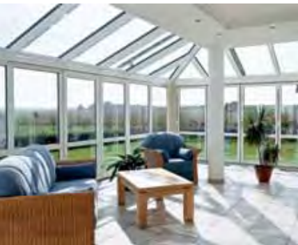
Stylish white is just one option