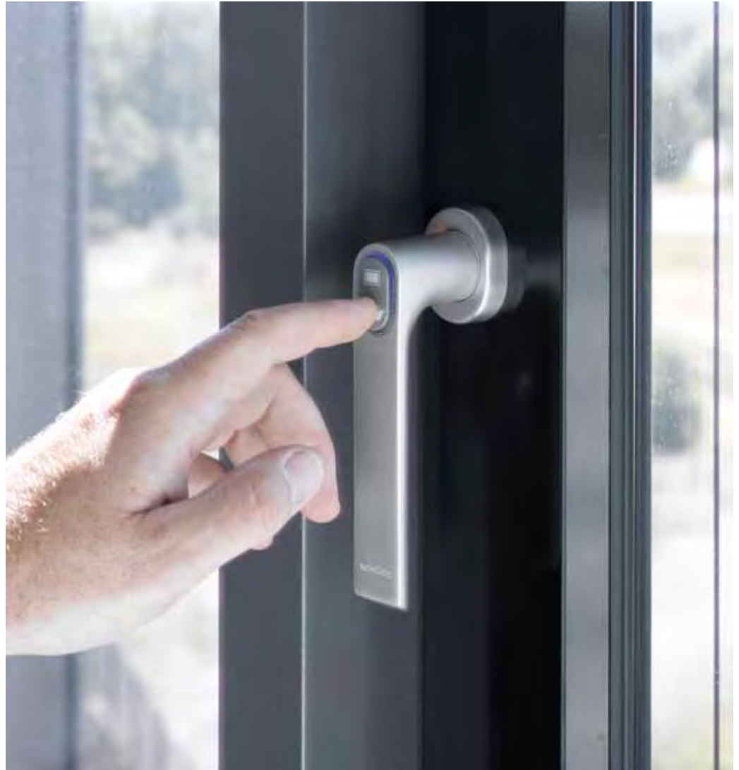
Automation at the touch of a button

The ultimate in domestic luxury, Schueco's TipTronic mechatronic opening system is an option you may find hard to resist.