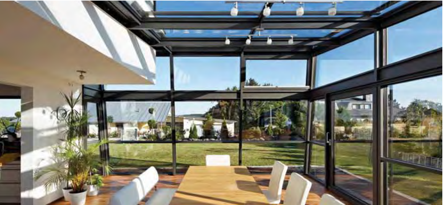
Add luxurious living space with a Schueco insulated conservatory