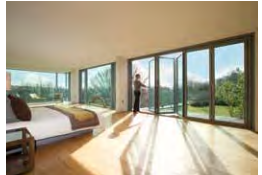
Open a Schueco folding door ...