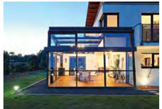
Draught-free and warm at night

Everyone loves a conservatory; it's a space where you can feel uniquely alive. But to enjoy its warmth and light to the full, you need the very best in quality engineering.