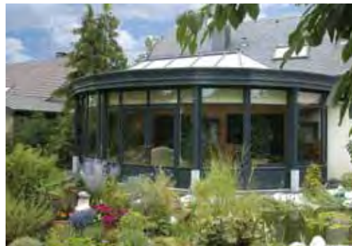
Traditional or contemporary appearance