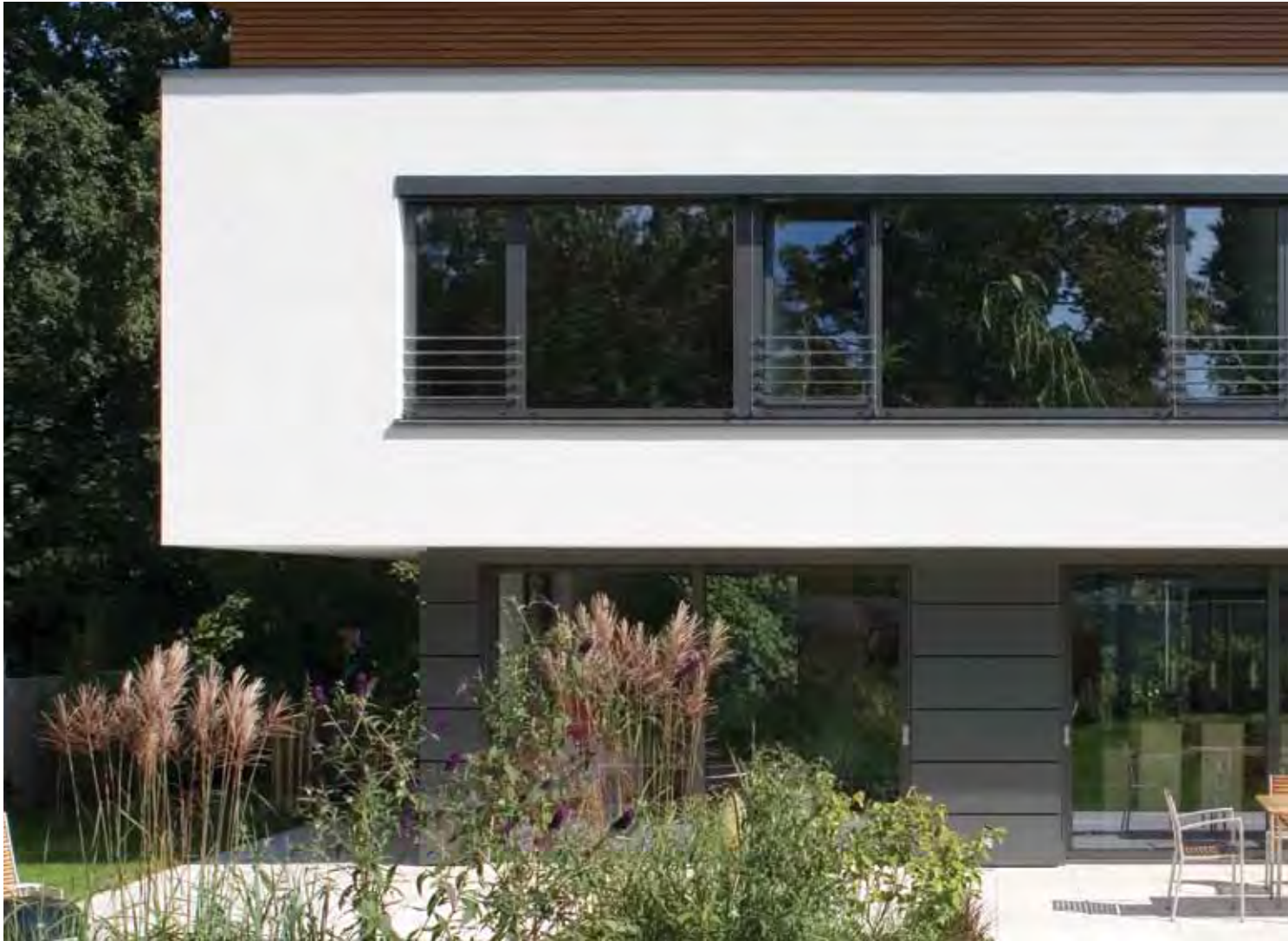
Perfectly proportioned windows enhance architectural brilliance

We all know how important windows are to the look of a home and with The Schueco Contemporary Living Collection, it's never been easier to get these right.