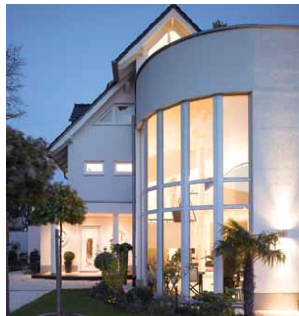
Schueco super-insulated façades are just one design option