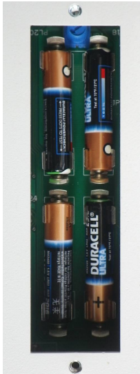
Picture shows battery orientation and display contrast control

The AVjog (TM) Cable Tester comes with a plug top mains adaptor which may require fitting of the correct plug pin assembly. The tester will also work using four AAA batteries (not rechargeable ones). Access to the battery holders is via the front panel. Using a screwdriver to undo the screws holding the panel on the top of the tester to gain access to the battery compartment. Fit the four 1.5 volt AAA batteries observing correct polarity.