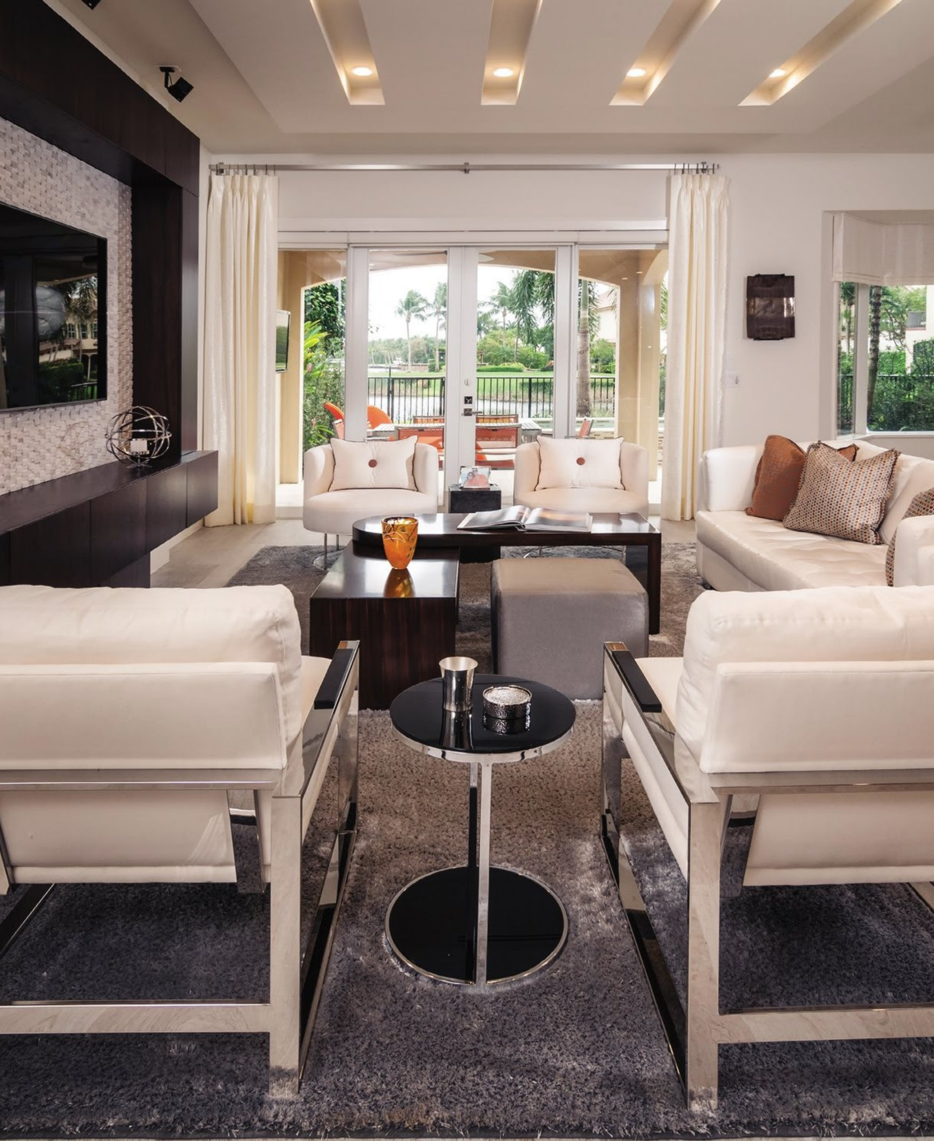
The open living area incorporates artful lighting and soffits to highlight different spaces and add architectural interest.