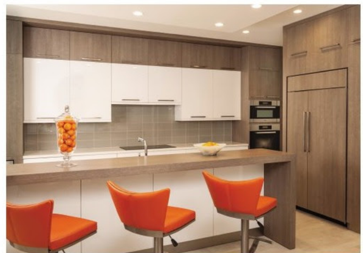
A free-standing island finished in white acrylic and textured wood grain laminate with vibrant orange bar stools is the center piece of the kitchen.

With the last child off to college, the Smiths decided it was time for a change. “We found ourselves with this big house and just the two of us,” Lennie says. “It didn’t make any sense. We travel a lot, and with the townhome, we can just lock the doors and leave.”