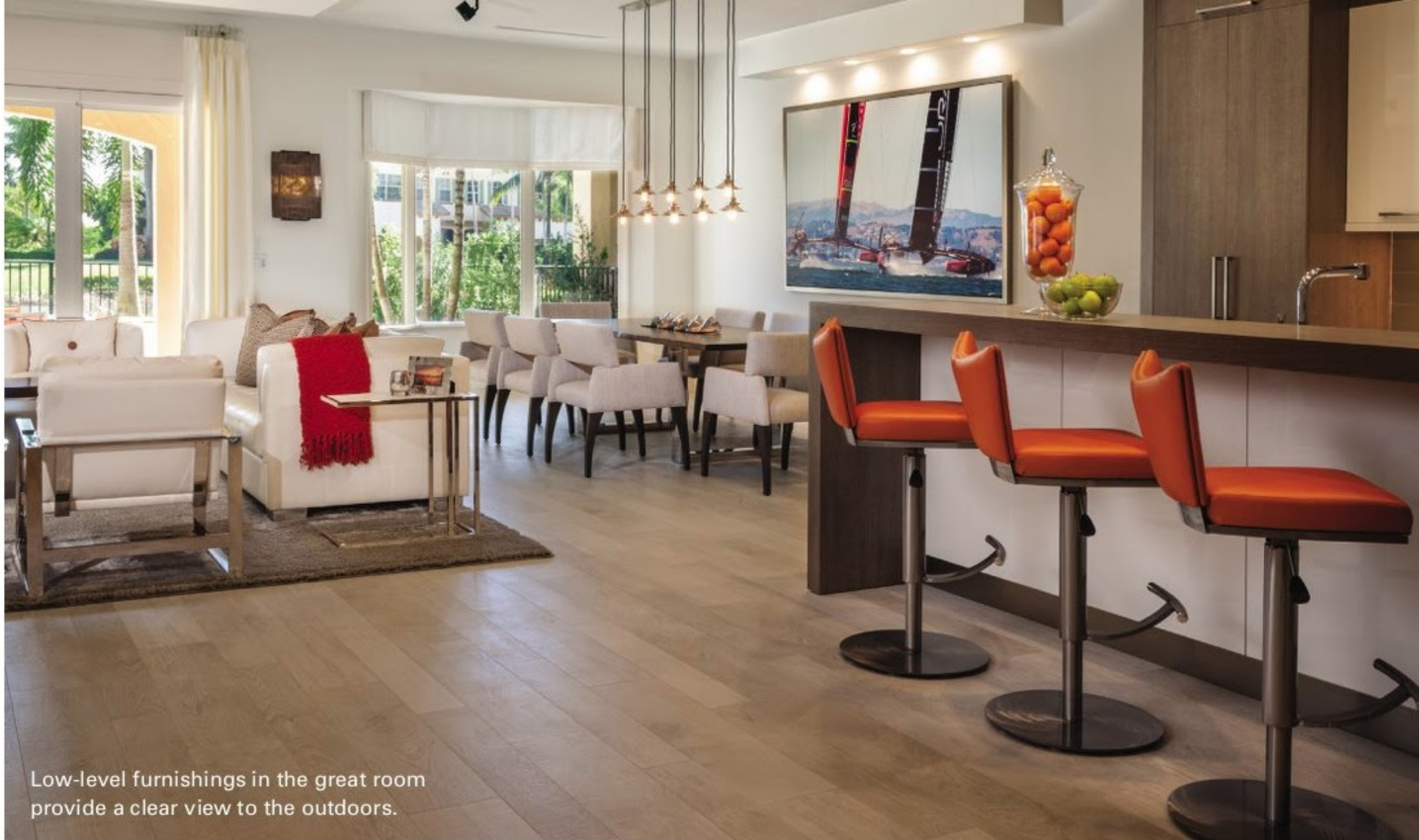
Low-level furnishings in the great room provide a clear view to the outdoors.