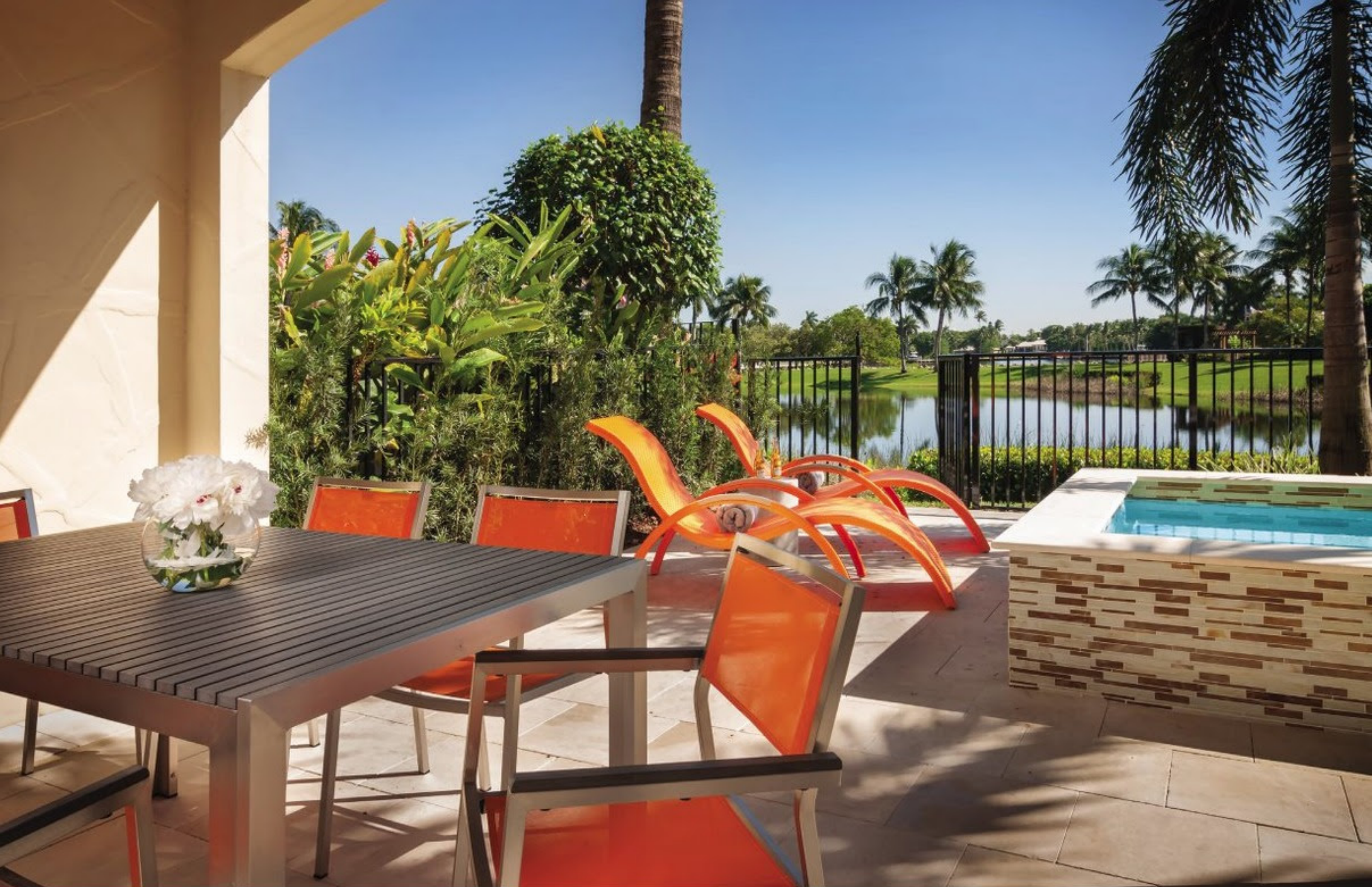
Outdoor dining and lounge areas offer a place to relax and enjoy the view.