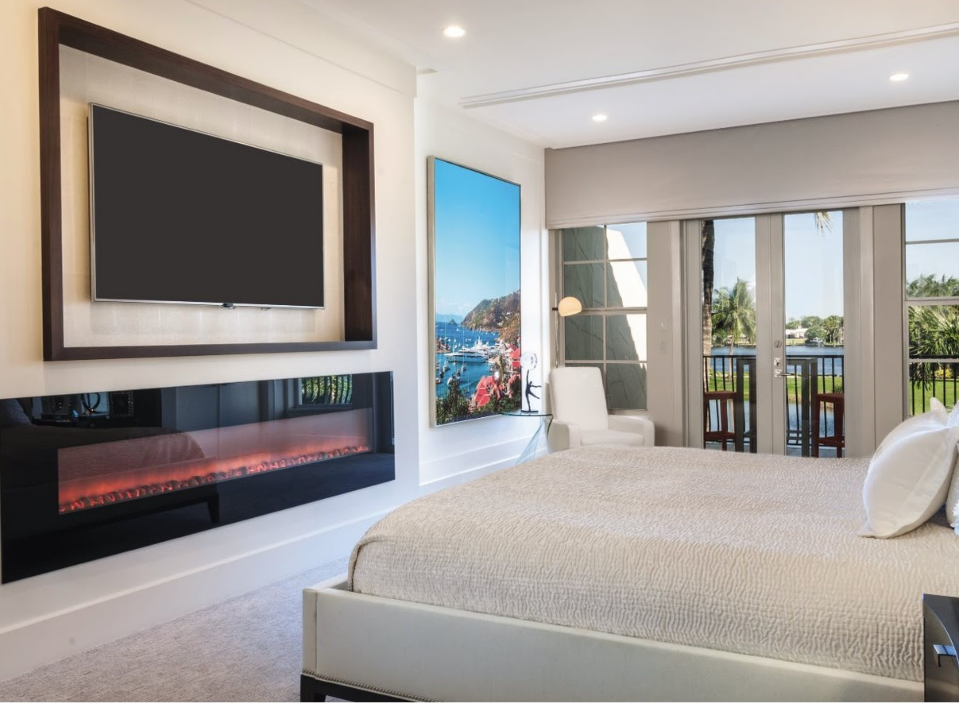
A dramatic linear fireplace provides a warm focal point in the master bedroom.