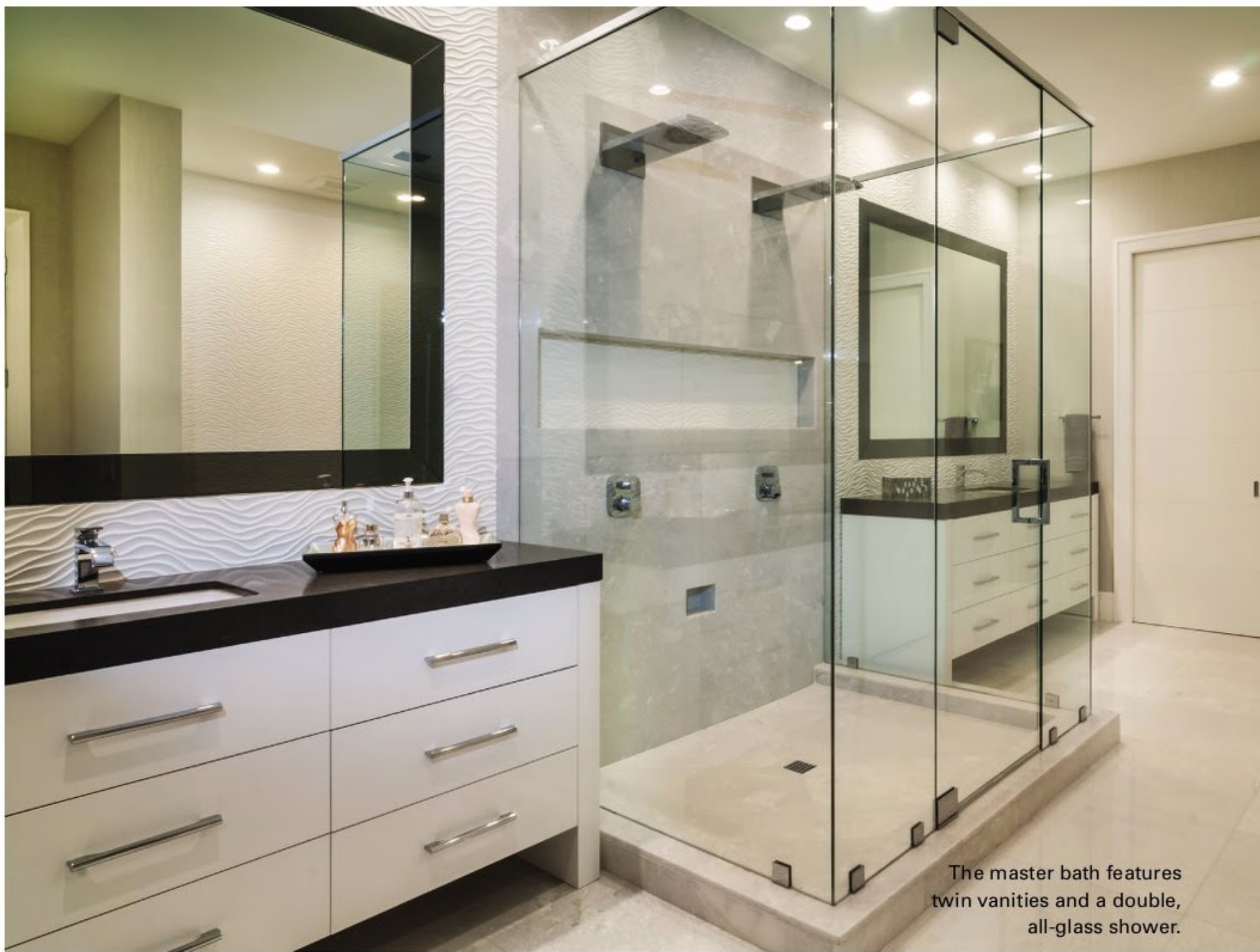
The master bath features twin vanities and a double, all-glass shower.

with wood ledges and linear textured wall covering the backs. “They didn’t want any remnants of the old design,” Connor says.