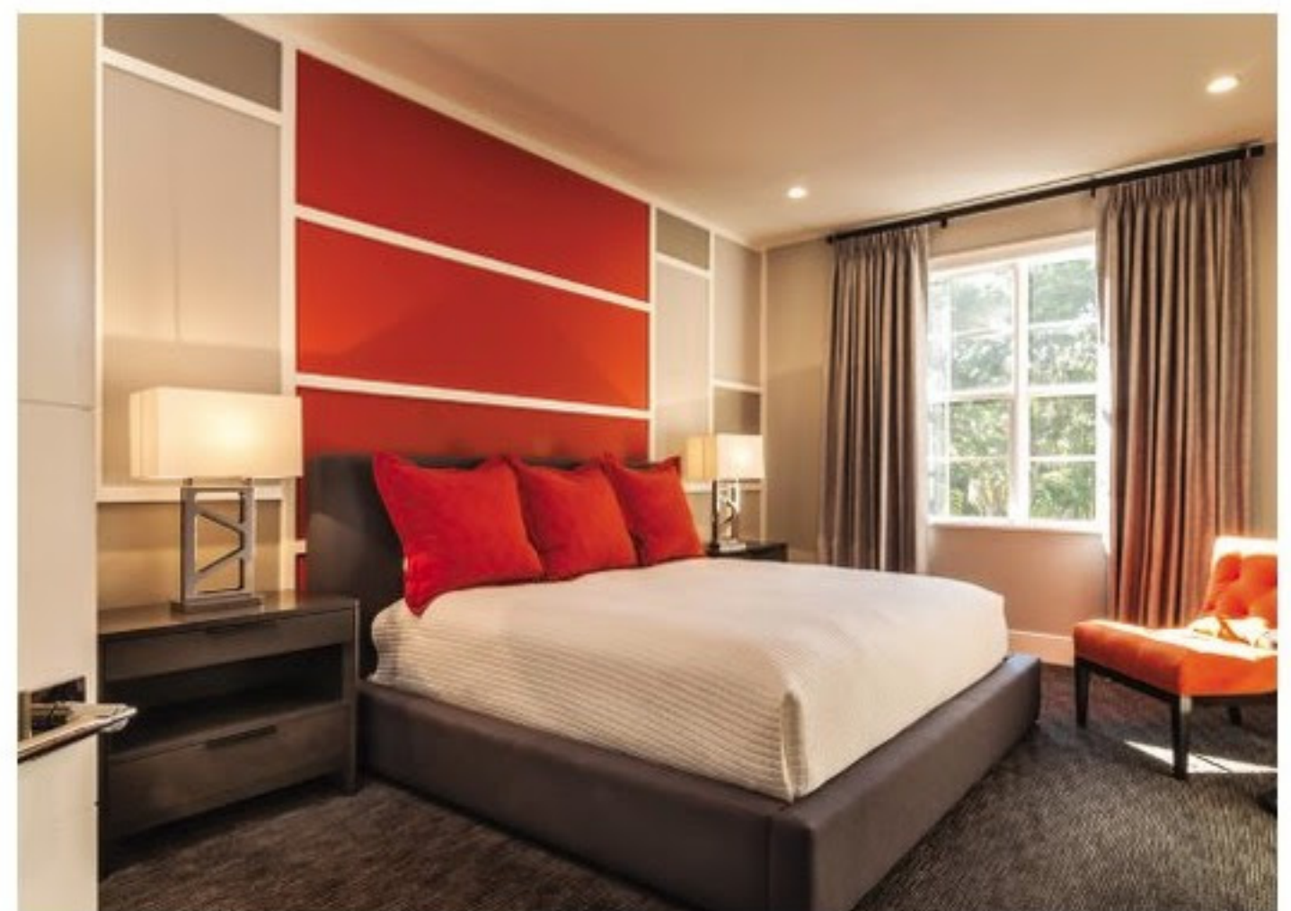
Orange painted panels create a playful feel in the guest room.

Adjacent to the kitchen is the dining area, which features a rectangular, live-edge oak table with highly polished stainless legs. Eight clean-lined, comfortable chairs are upholstered in soft gray linen. Above the table is a simple yet dramatic light fixture with multiple pendants. The Smiths are avid sailors, and on the dining room wall hangs a large framed photograph of a scene from the World Cup race. A soffit above houses multiple recessed light fixtures that illuminate the artwork.