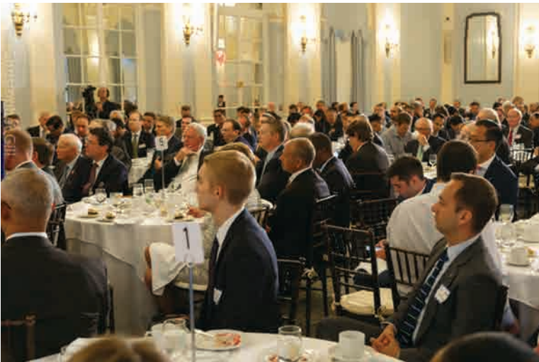
Sold out audience for the Anniversary Luncheon.