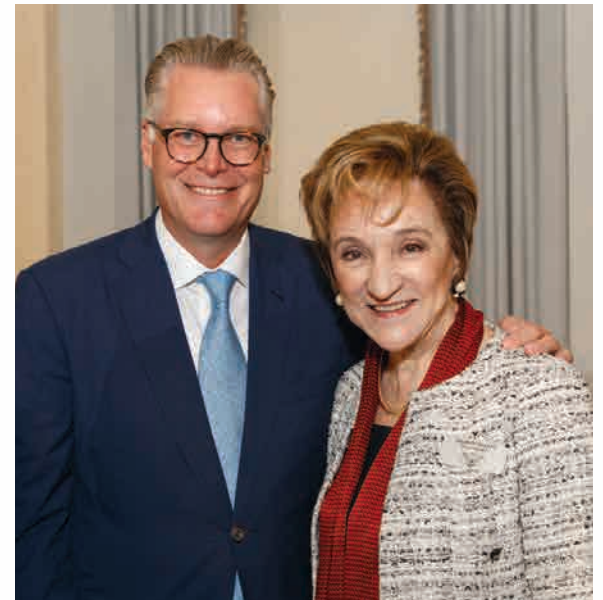
Edward Bastian, Marion Blakey