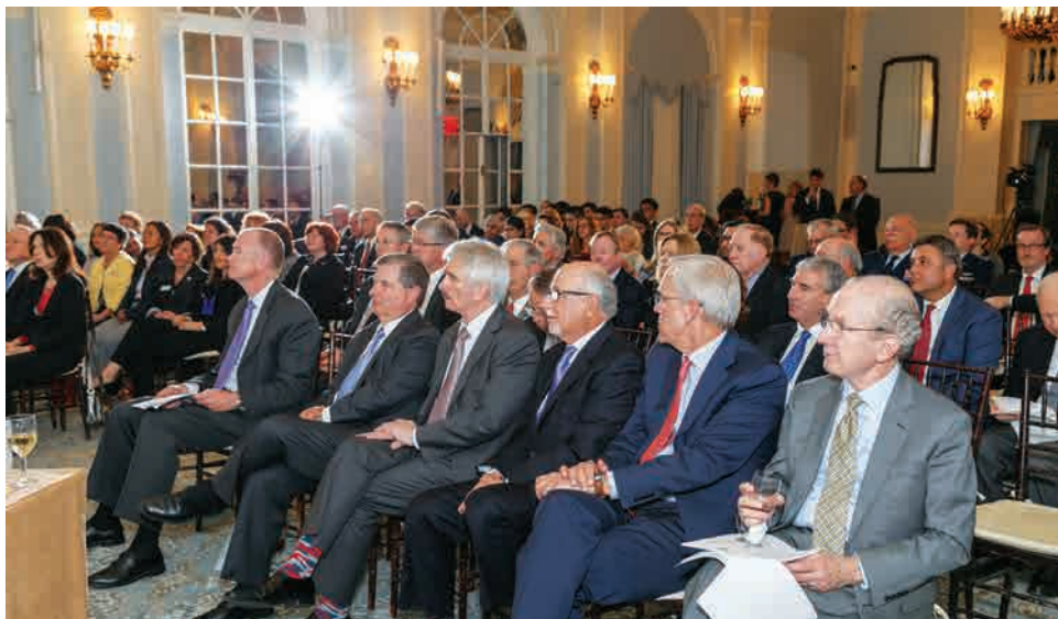
Annual Meeting in progress