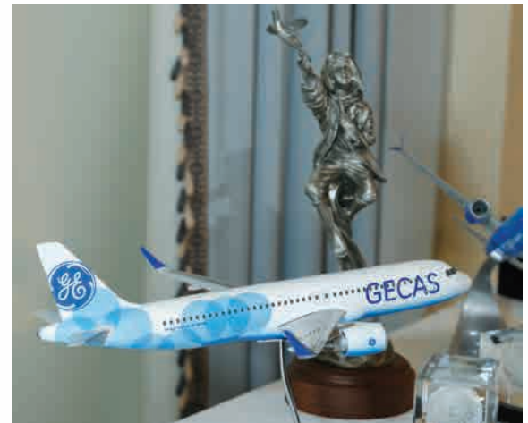
Door prizes provided by GE