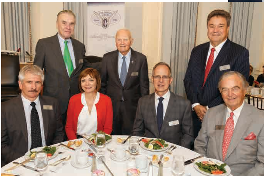
Past Wings Club Presidents attending the 75th Anniversary Luncheon