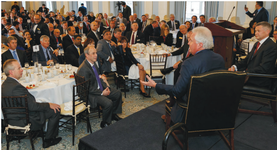
Jeffrey Immelt addressing the audience