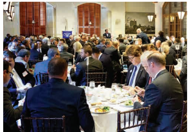
Another sold out crowd for the June luncheon