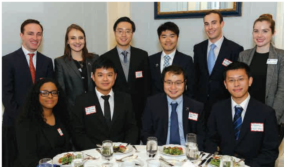
Students from New York University