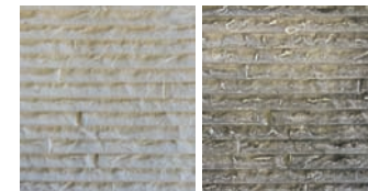
beige tile option

refer to page 41 for the full list of options