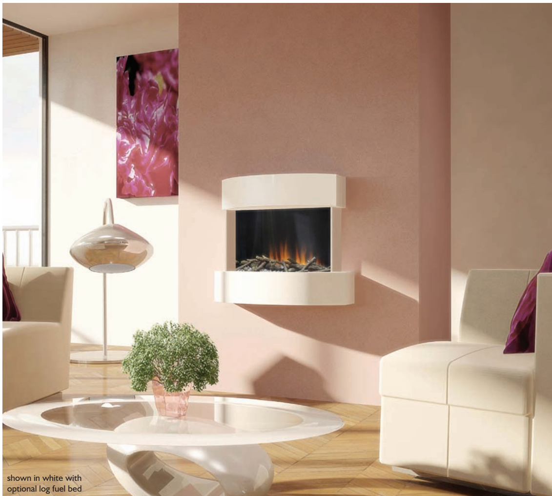
shown in white with optional log fuel bed