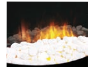
white pebble set