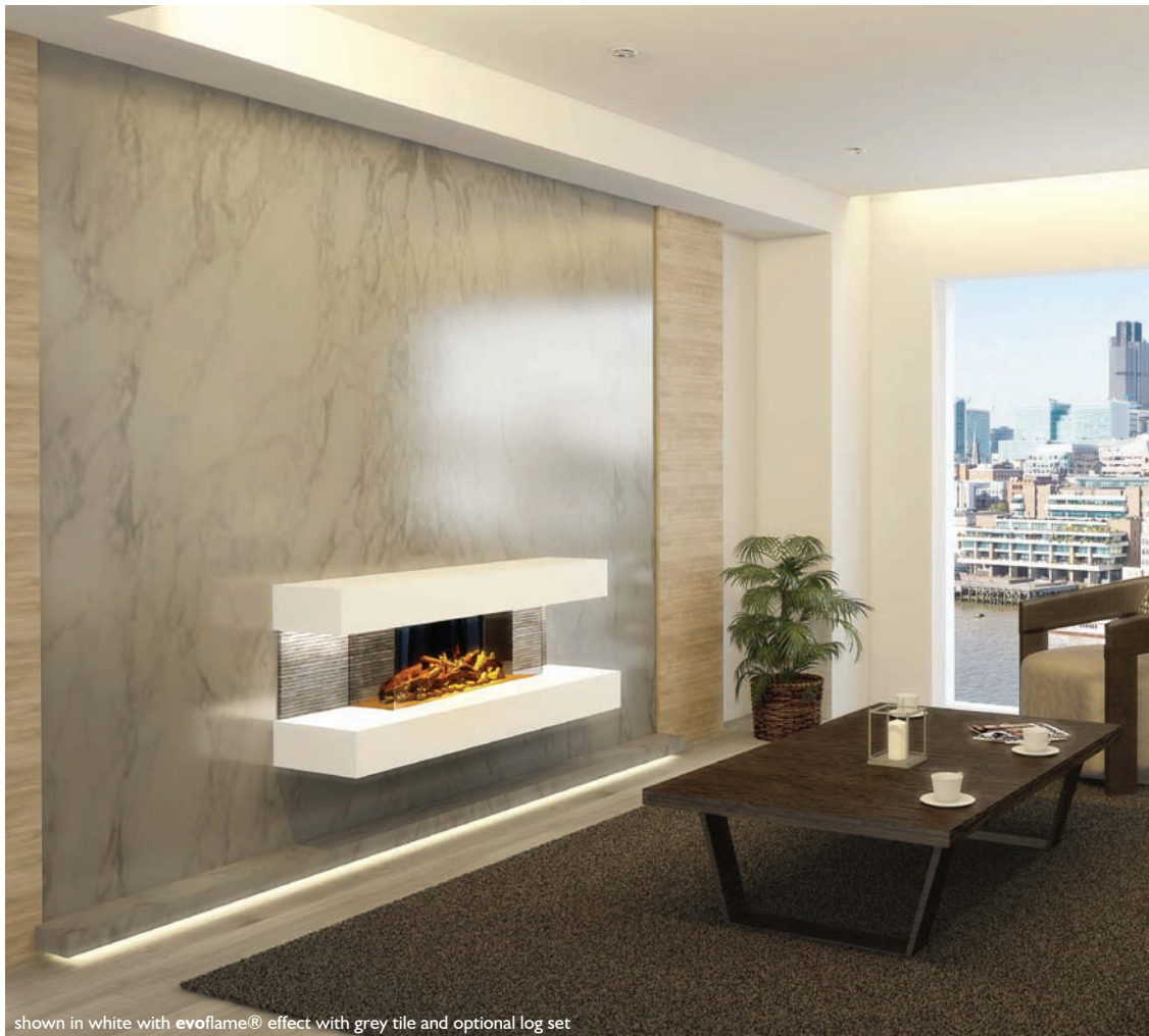
shown in white with evoflame® effect with grey tile and optional log set