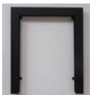
50 or 75mm spacer