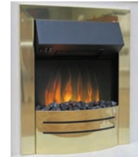
shown in brass with ribbon effect

refer to pages 40 - 41 for the full list of options