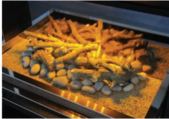
the fuel bed showing the evoflame® effect

refer to page 41 for the full list of options