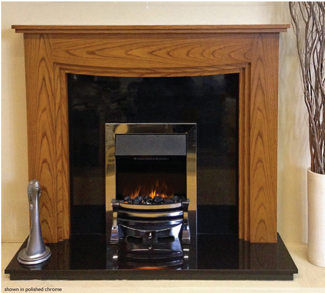
shown in polished chrome