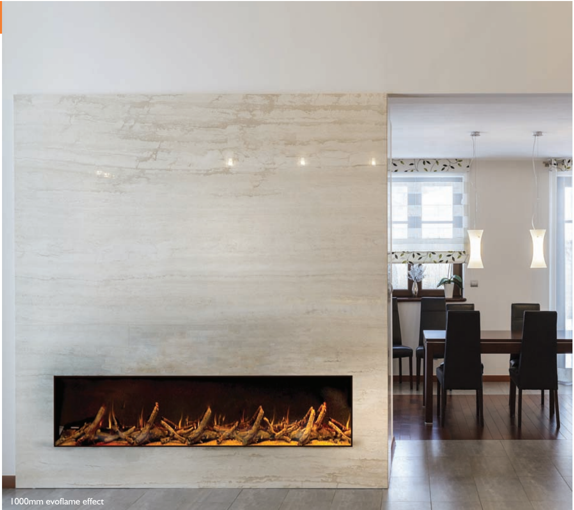
1000mm evoflame effect

for technical specifications please refer to page 43