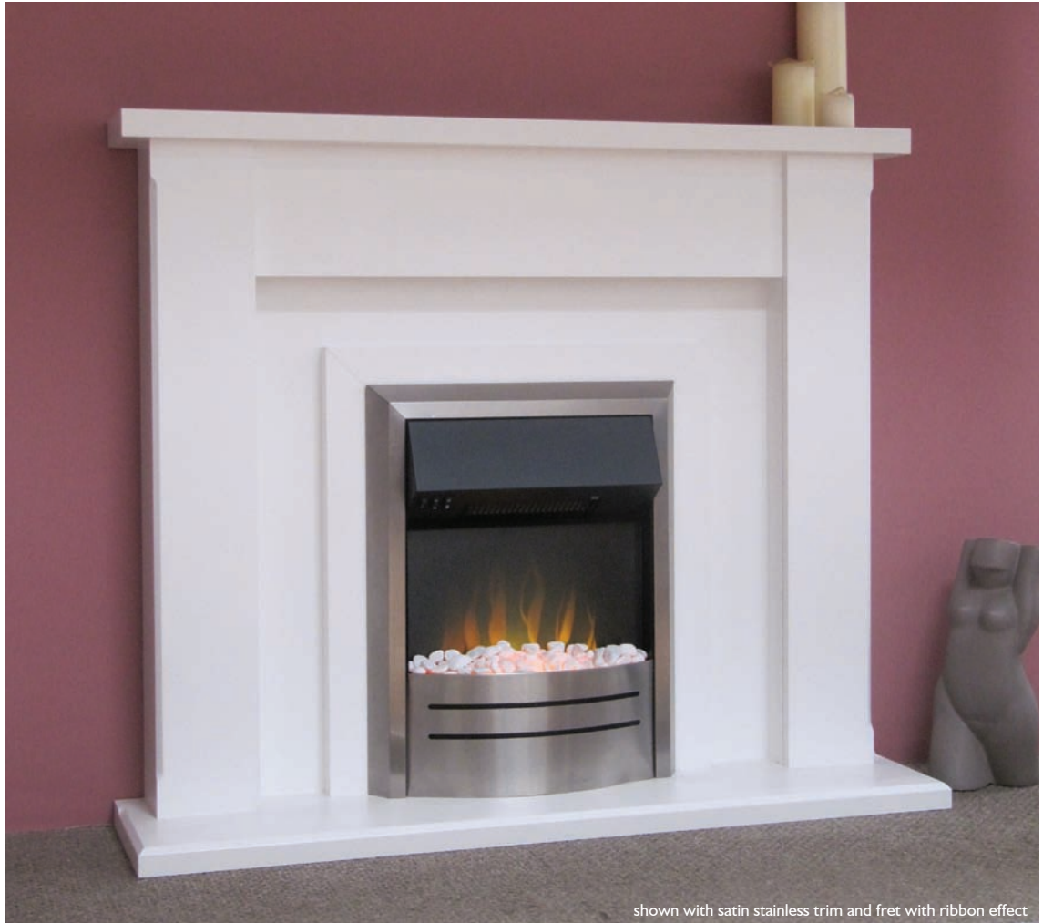
shown with satin stainless trim and fret with ribbon effect

for technical specifications please refer to page 43