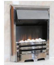
shown in polished chrome with ribbon effect