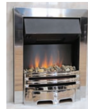
shown in polished chrome with ribbon effect