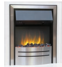
shown in satin stainless

refer to pages 40 -41 for the full list of options