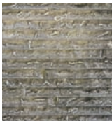
grey tile option