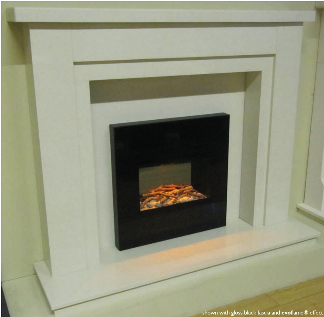
shown with gloss black fascia and evoflame® effect