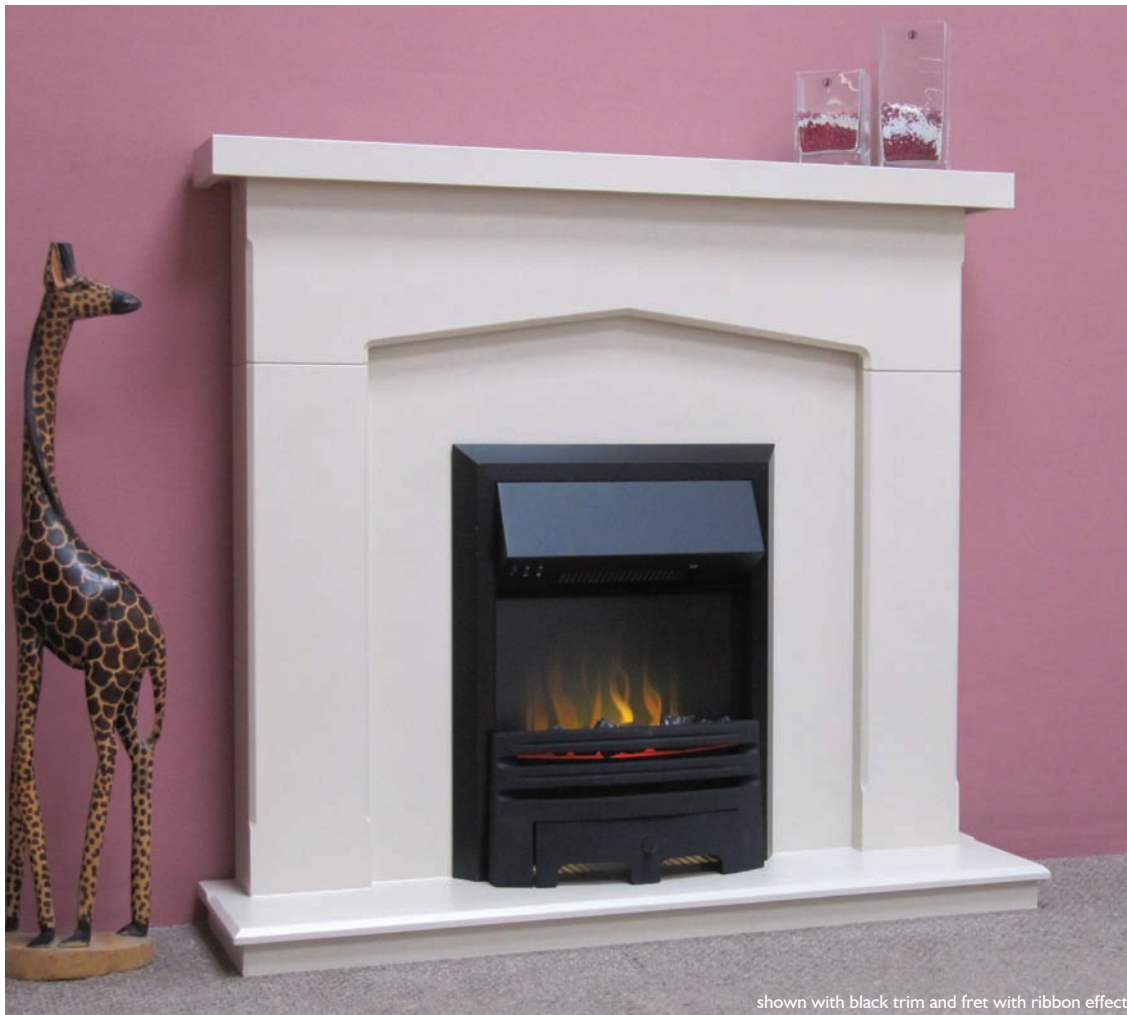
shown with black trim and fret with ribbon effect