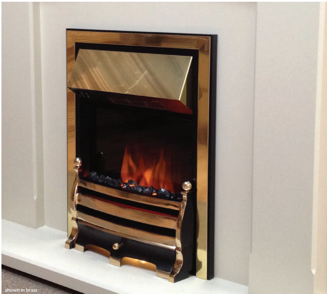
shown in brass