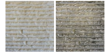
beige tile option

refer to page 41 for the full list of options