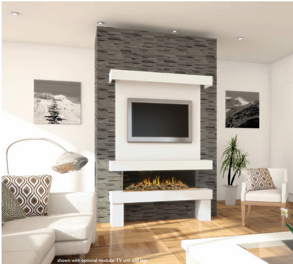
shown with optional modular TV unit and legs