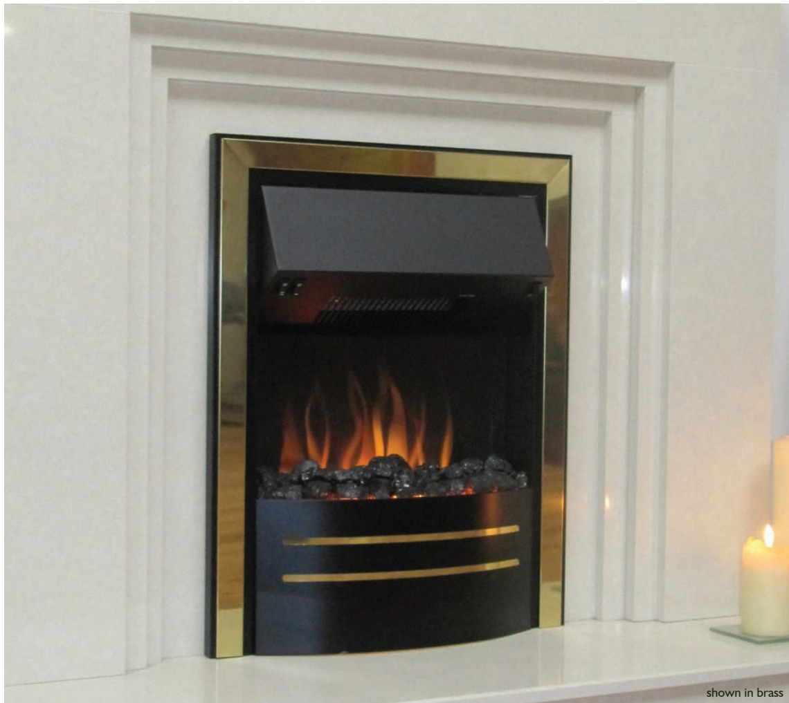
shown in brass