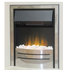
shown in polished chrome

for technical specifications please refer to page 43