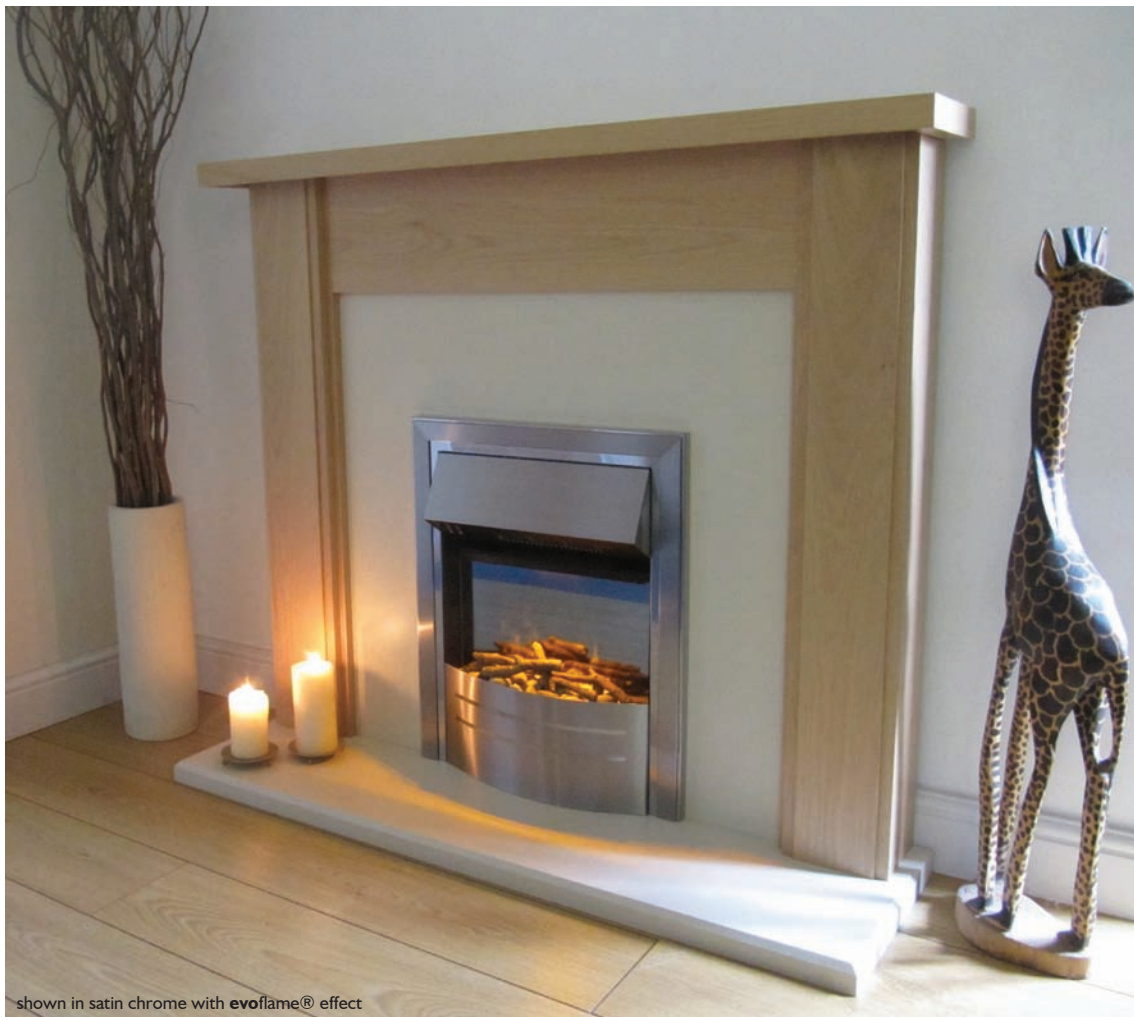
shown in satin chrome with evoflame® effect