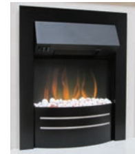
shown in black with ribbon effect