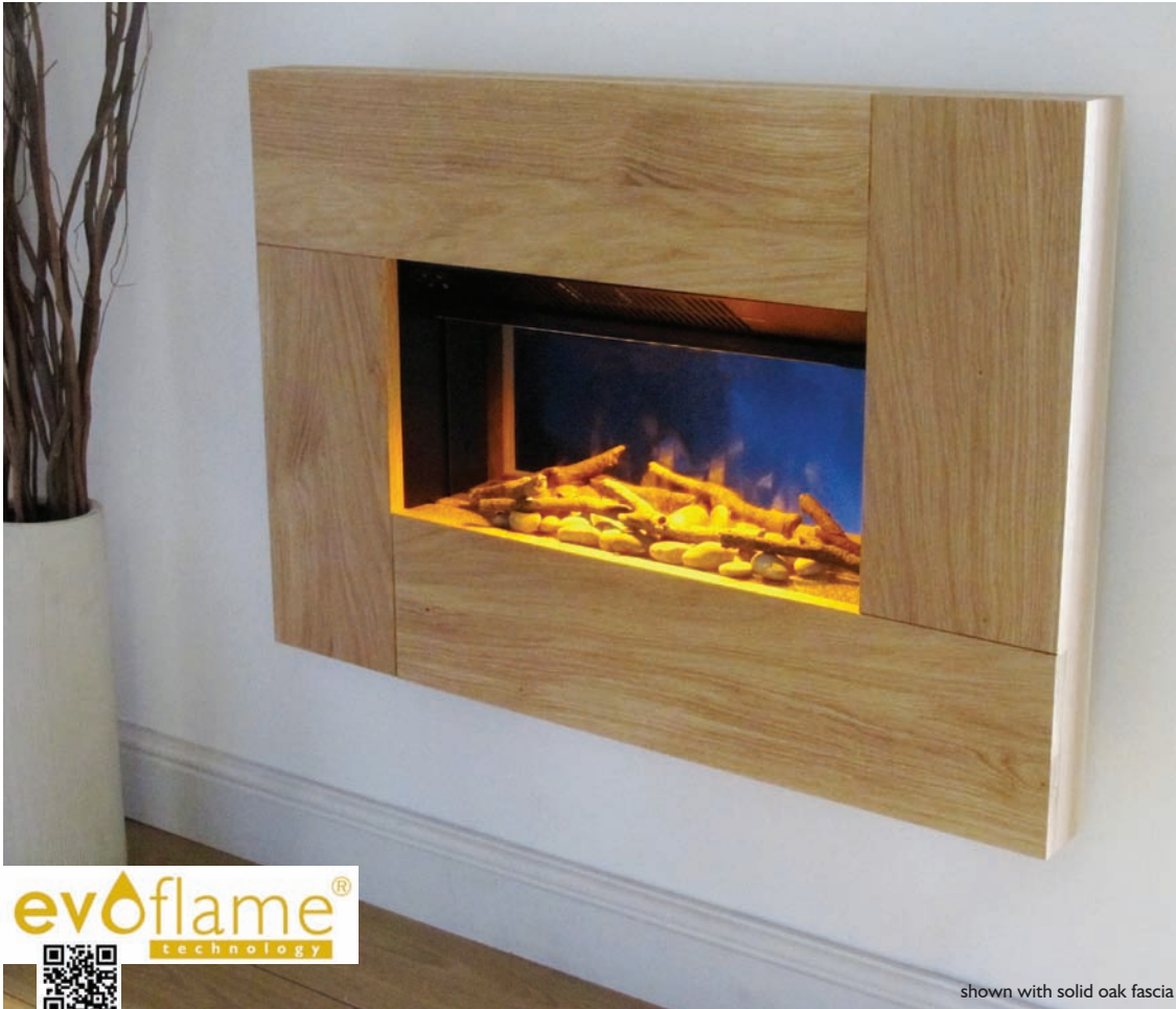
shown with solid oak fascia

for technical specifications please refer to page 43