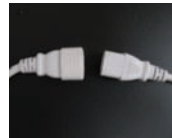
kettle plug connector