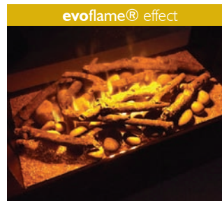
shown here with logs and beach pebbles

refer to page 40-43 for the full list of options