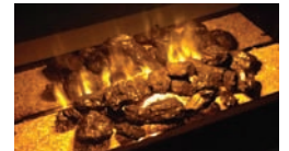
coals and hot ash fuel bed