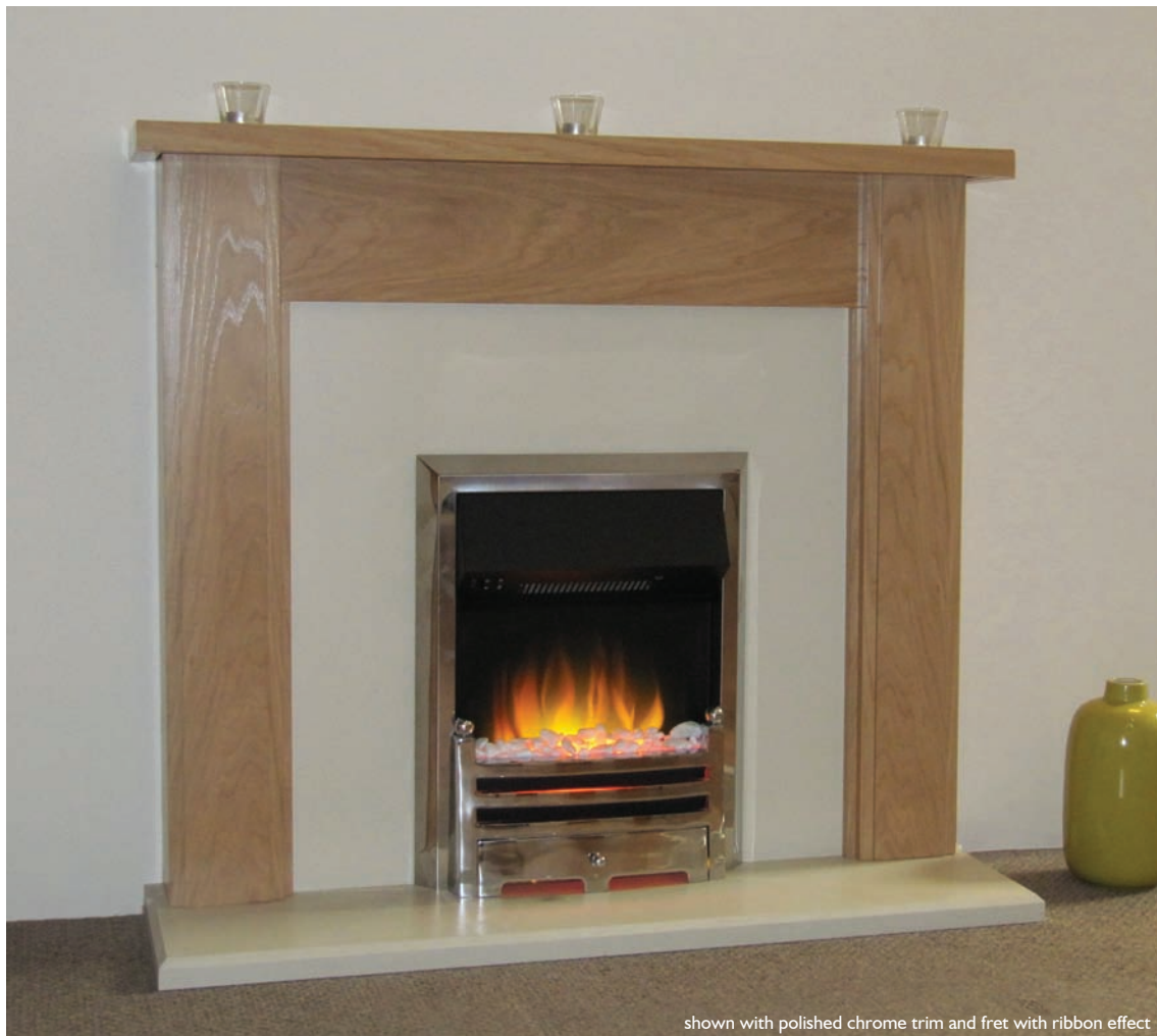
shown with polished chrome trim and fret with ribbon effect

for technical specifications please refer to page 43