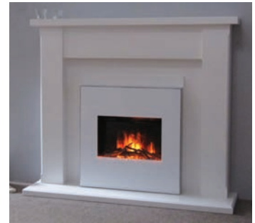
shown with white gloss fascia and ribbon effect

refer to pages 40 - 41 for the full list of options