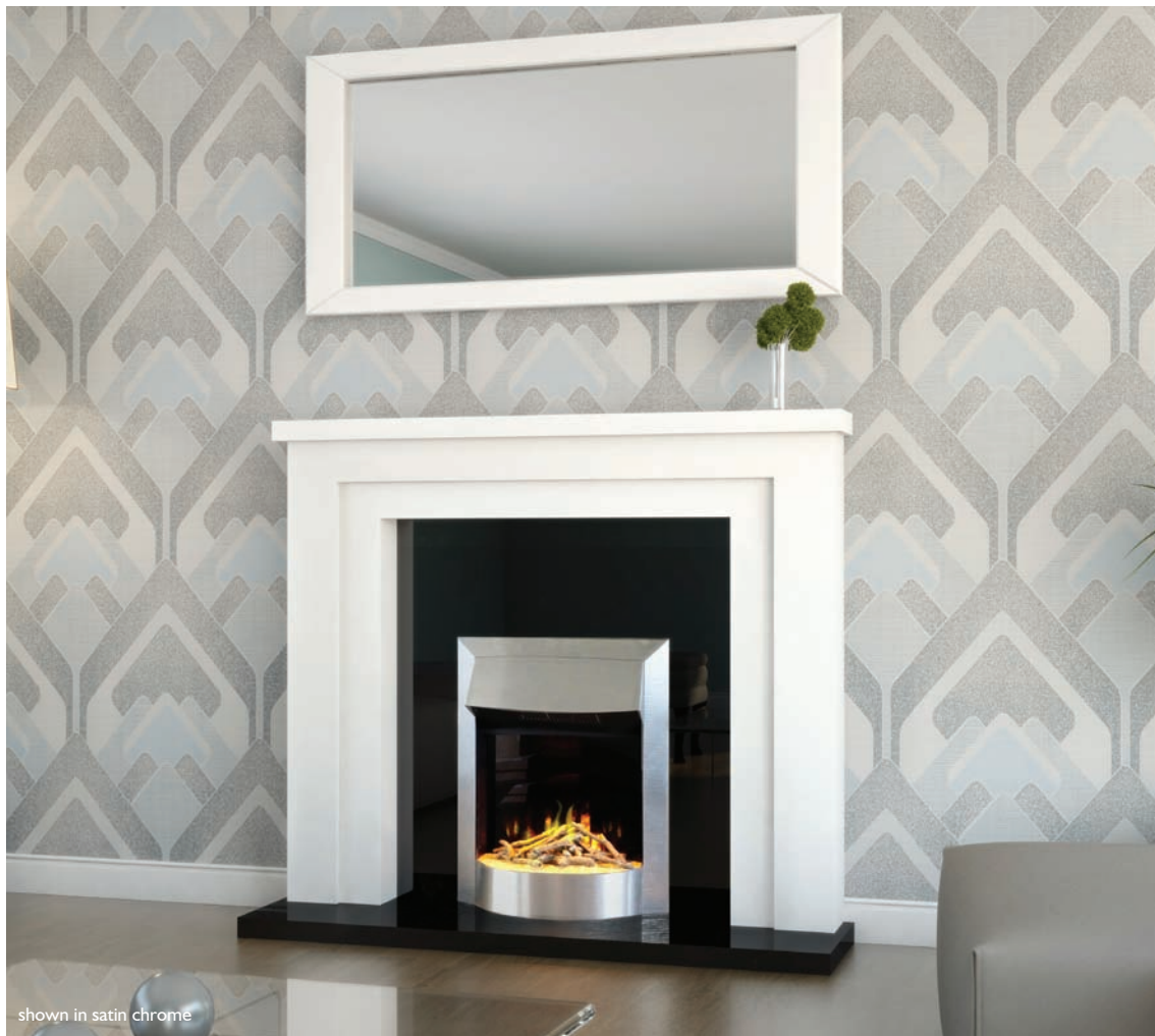
shown in satin chrome

for technical specifications please refer to page 43