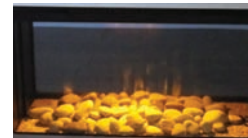
beech pebble and hot ash fuel bed