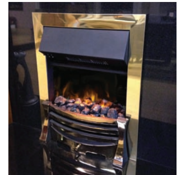
maya brass with evoflame® effect

refer to page 41 for the full list of options