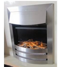
shown in satin stainless

refer to page 41 for the full list of options