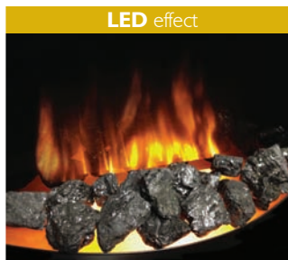
shown here with coals