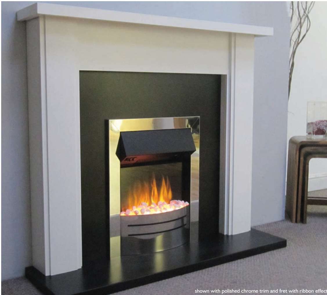
shown with polished chrome trim and fret with ribbon effect