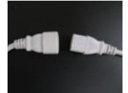
kettle plug connector