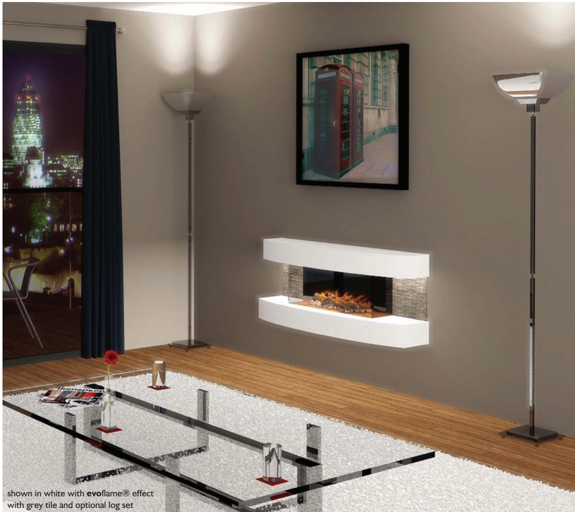
shown in white with evoflame® effect with grey tile and optional log set

for technical specifications please refer to page 42