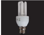
low energy 20W bulb