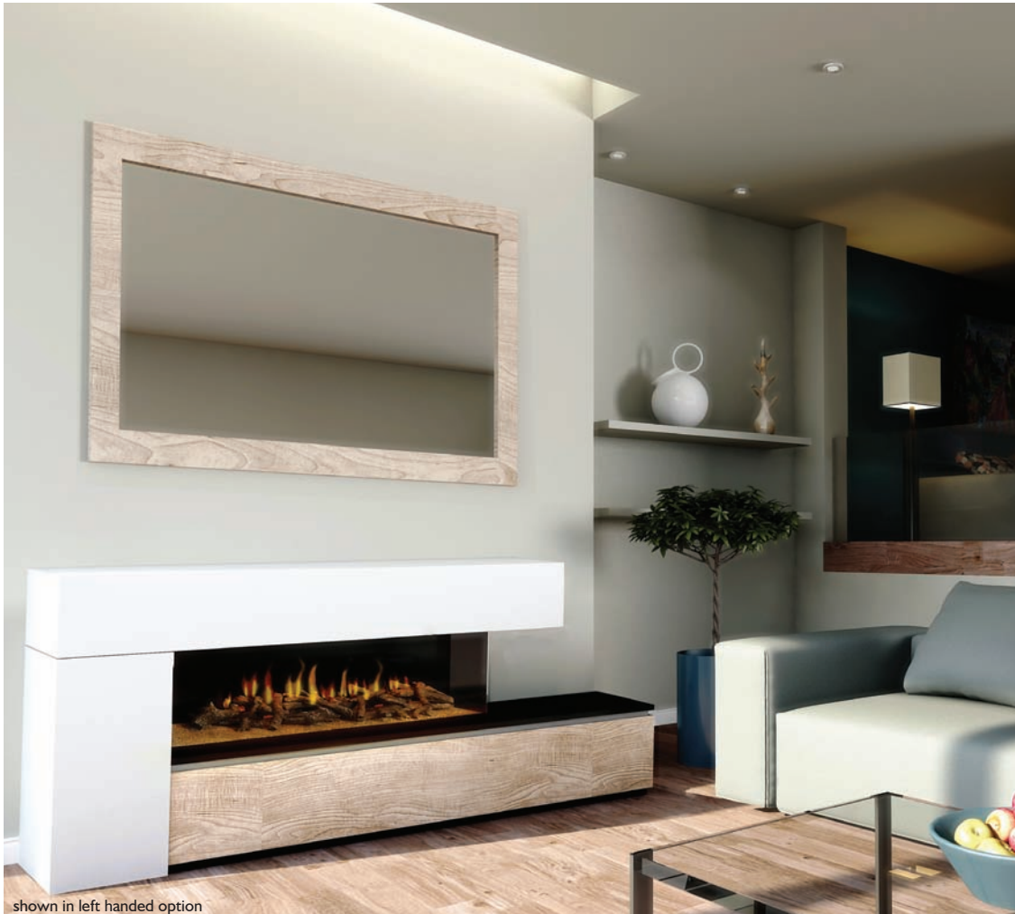
shown in left handed option

refer to page 41 for the full list of options