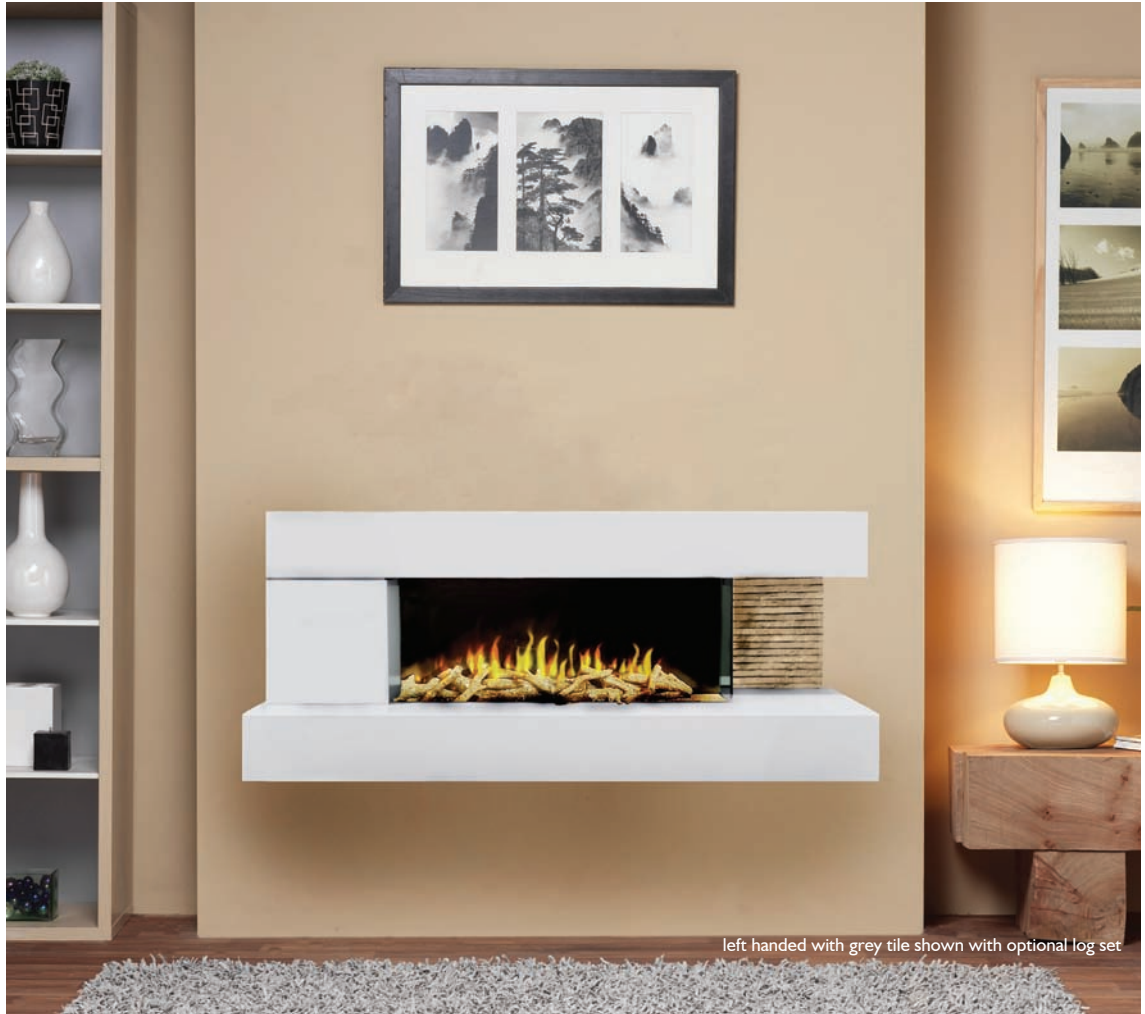
left handed with grey tile shown with optional log set

for technical specifications please refer to page 42