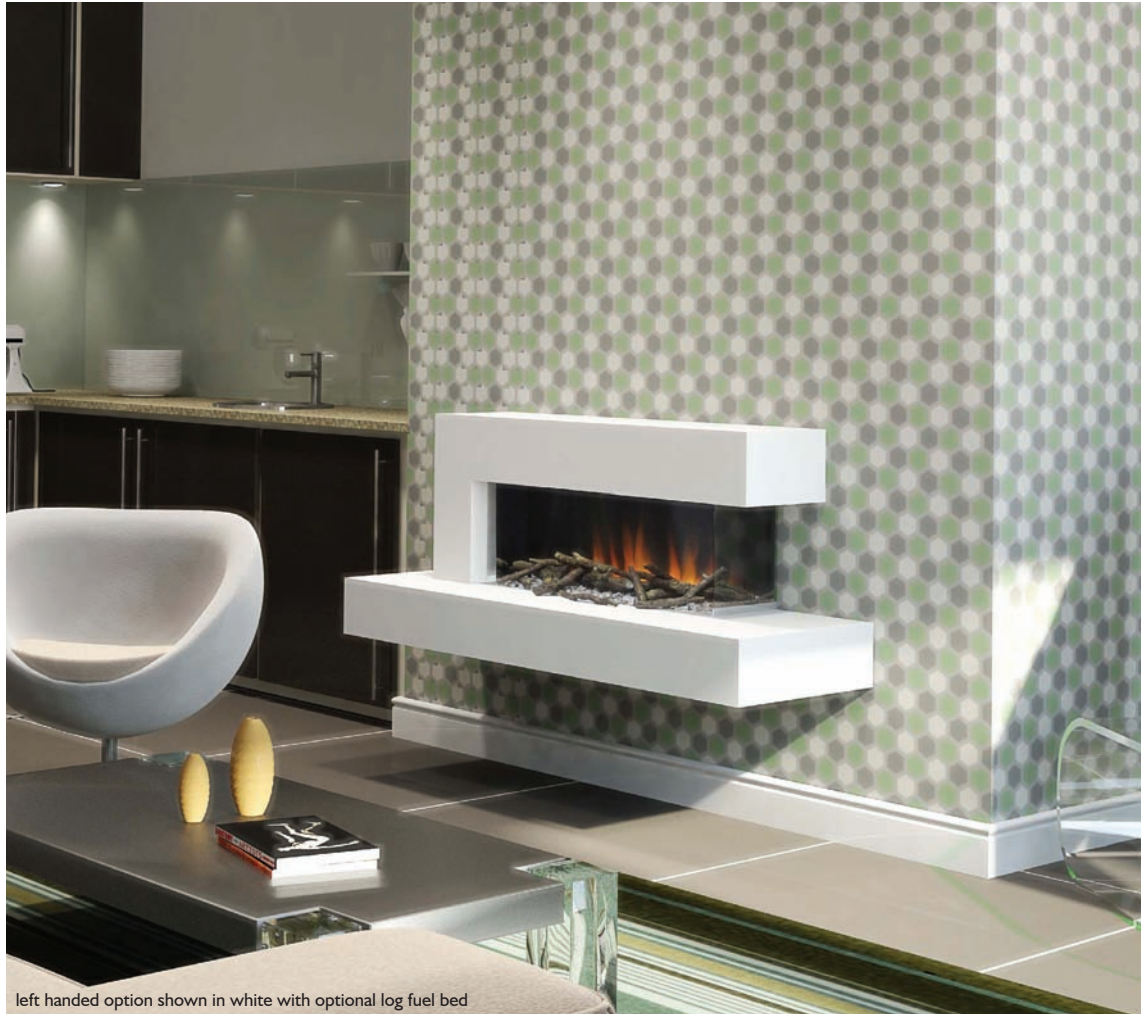
left handed option shown in white with optional log fuel bed

refer to page 40 for the full list of options