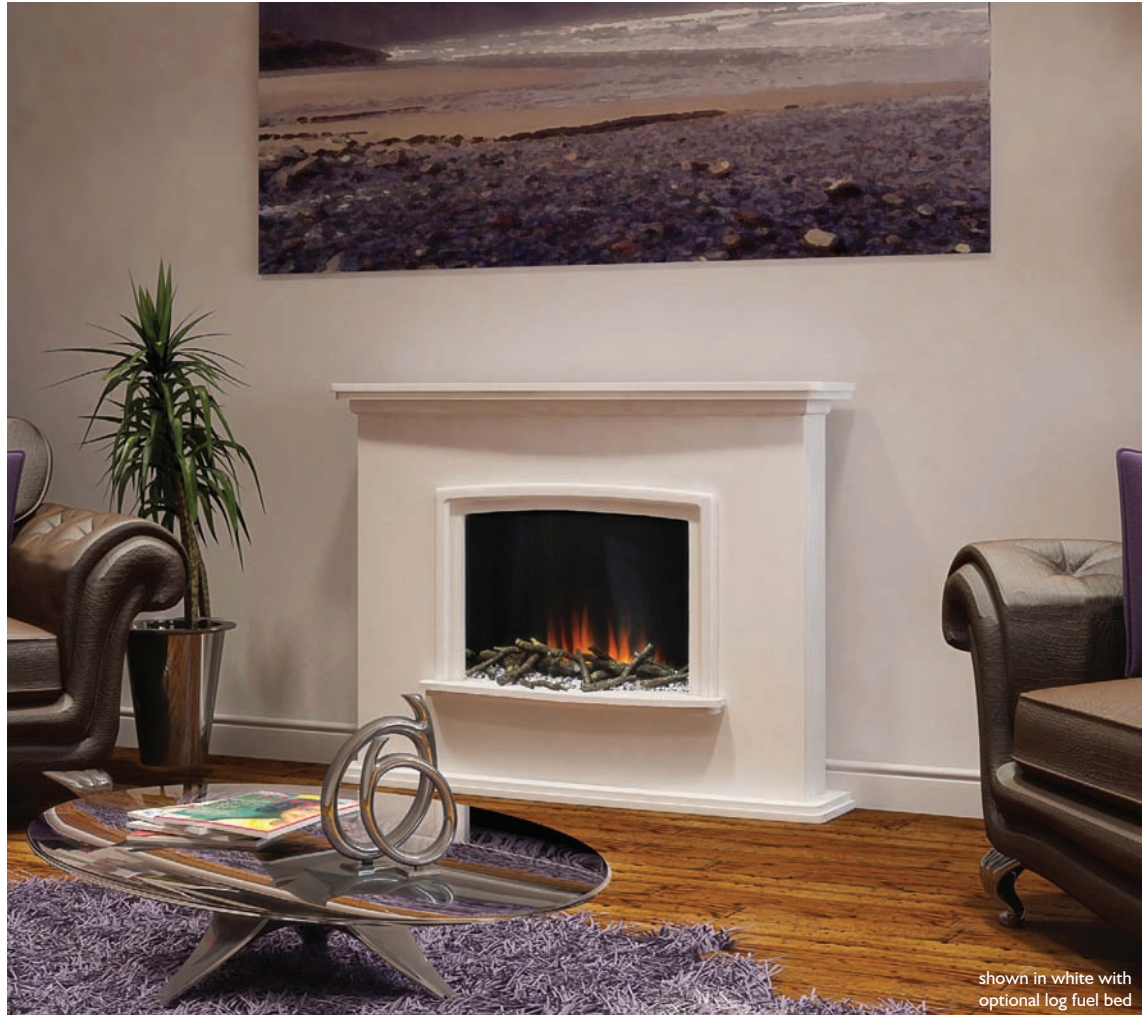
shown in white with optional log fuel bed