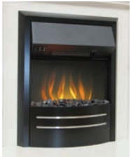
shown in black with ribbon effect