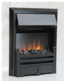
shown in black with ribbon effect

for technical specifications please refer to page 43