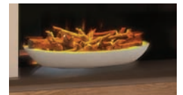
ceramic dish (suites only)