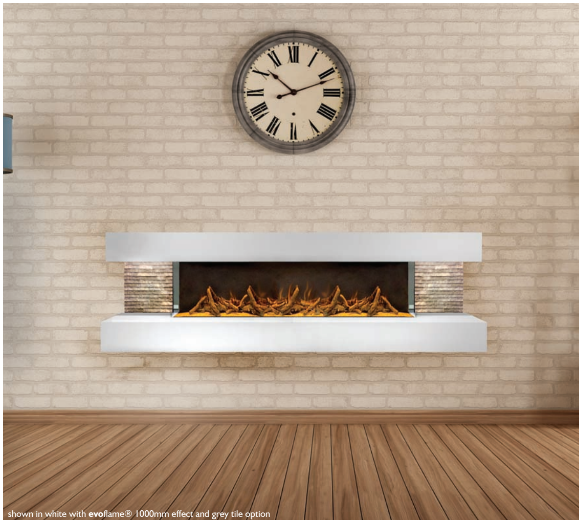
shown in white with evoflame® 1000mm effect and grey tile option

for technical specifications please refer to page 42