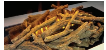
standard log set