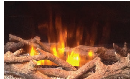
variable low setting (with optional remote only)