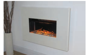
shown with stone effect fascia

for technical specifications please refer to page 43