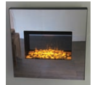
shown with mirror fascia and evoflame® effect

for technical specifications please refer to page 43