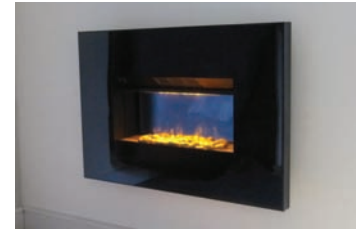
shown with gloss black fascia

refer to pages 40 - 41 for the full list of options