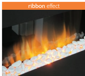
shown here with white pebbles