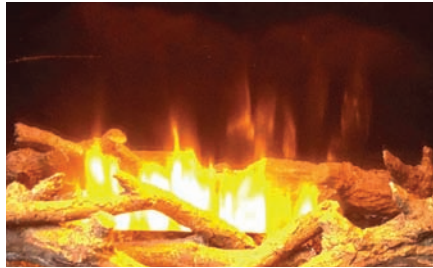
standard high setting

The evoflame® effect gives the impression of a deep and rich flame picture with a hot ash effect fuel bed via its unique reflectivity .The flame picture which is produced using LED's that provide 50,000 hours of running time can be fully variable to a high and low setting when using the optional remote control.