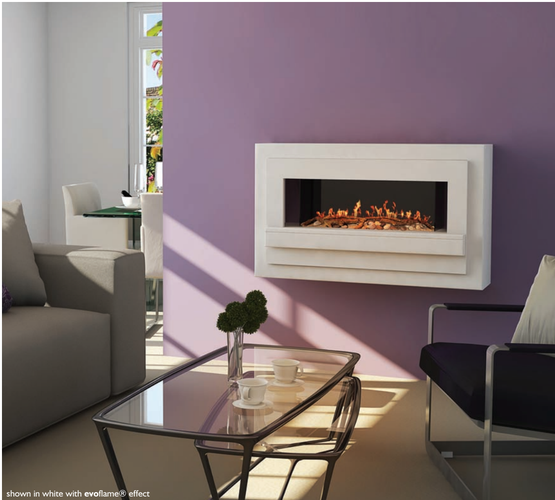
shown in white with evoflame® effect