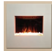
shown with stone effect fascia and ribbon effect