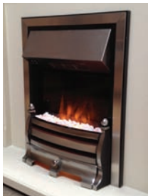
shown in satin stainless

refer to pages 40 - 41 for the full list of options