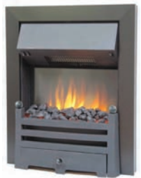
shown in black with ribbon effect

for technical specifications please refer to page 43