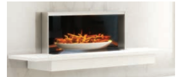
shown in white finish

refer to page 41 for the full list of options