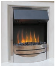
shown in polished chrome with ribbon effect

for technical specifications please refer to page 43