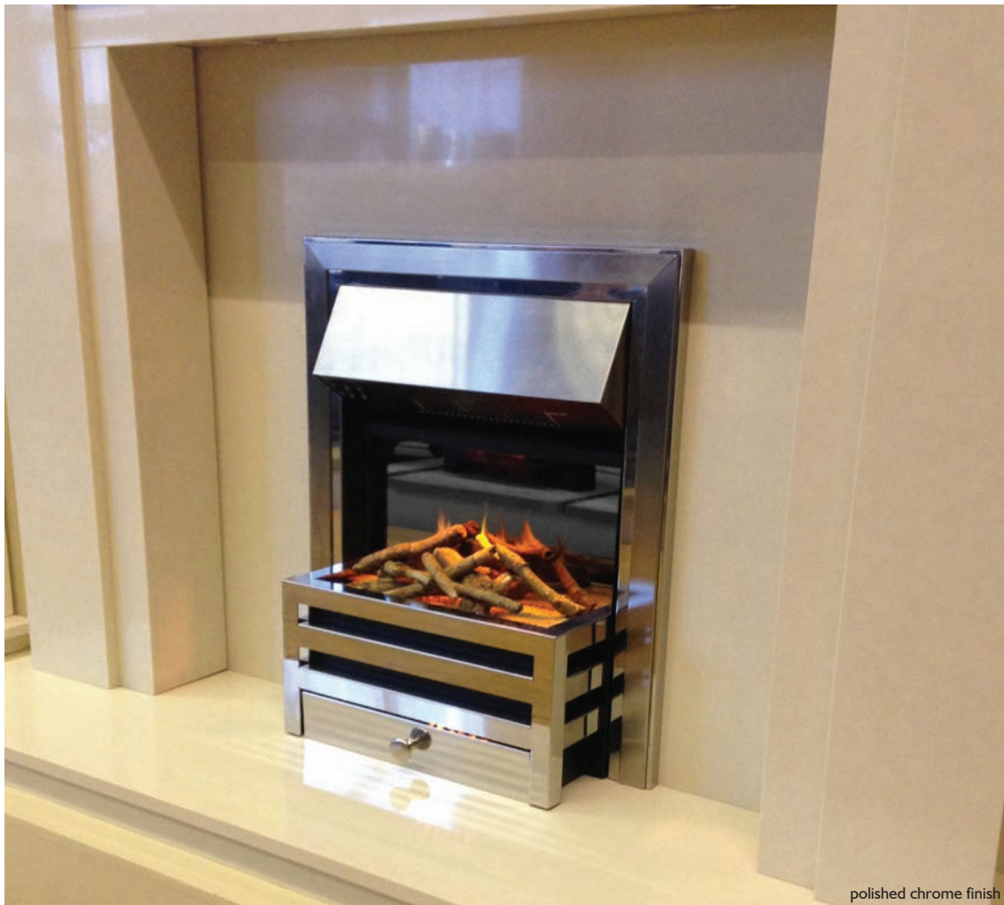
polished chrome finish