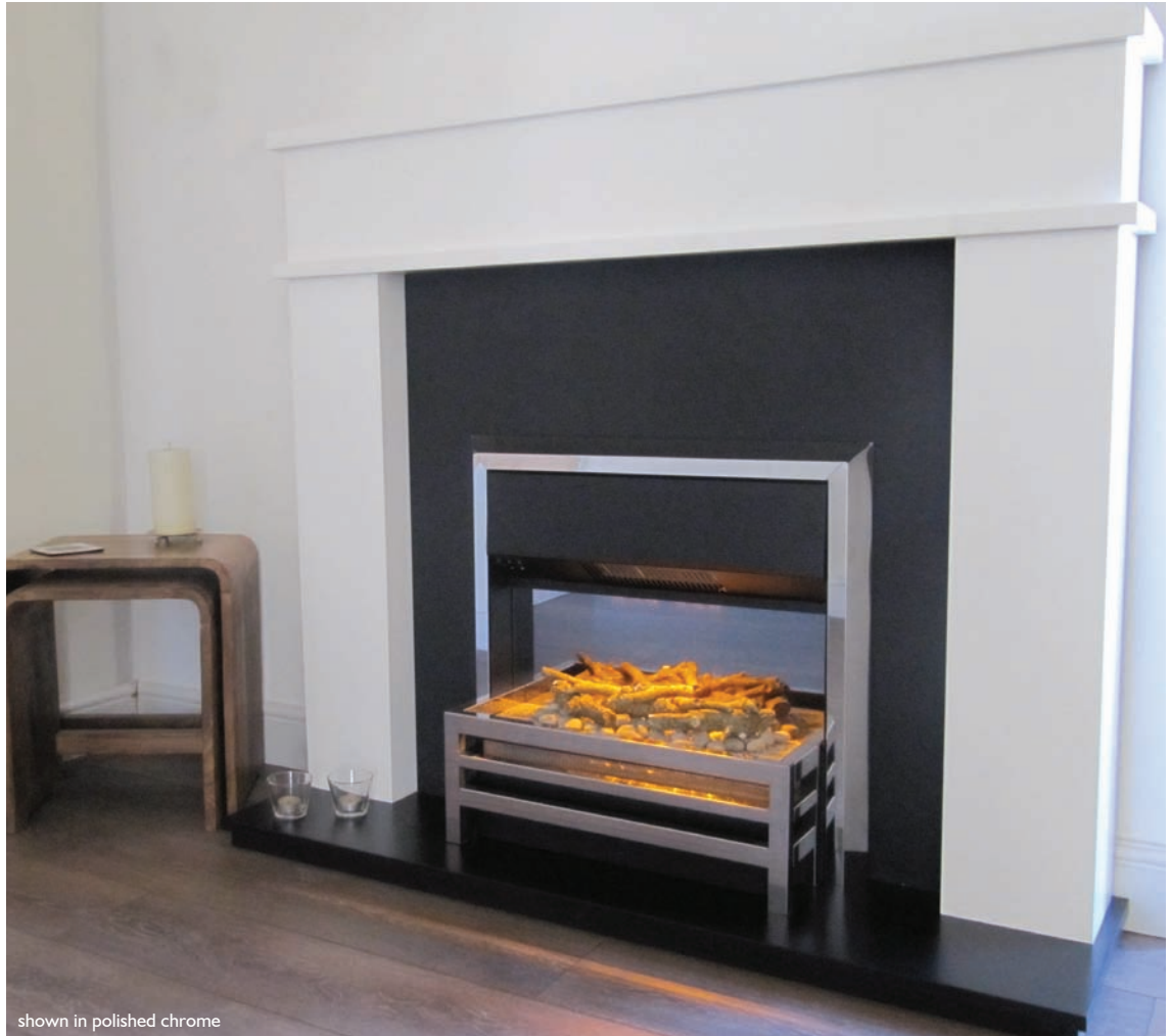
shown in polished chrome

for technical specifications please refer to page 43