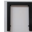
50 or 75mm spacer