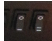
1kW or 2kW heater