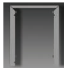
60mm spacer in satin stainless (brooklyn and harlem)