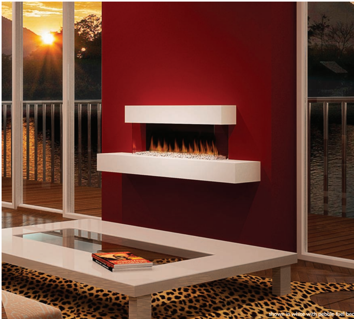
shown in white with pebble fuel bed