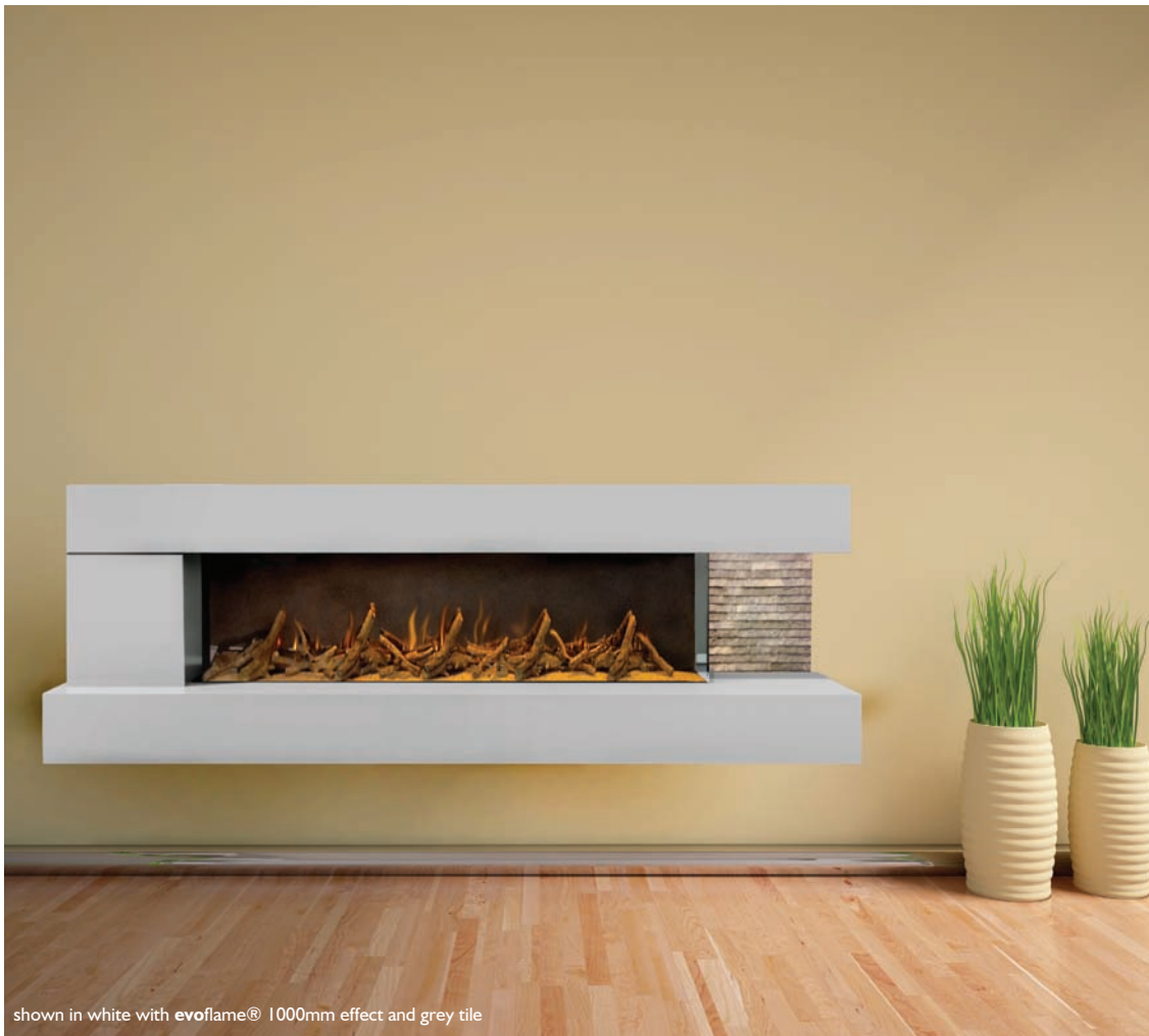
shown in white with evoflame® 1000mm effect and grey tile