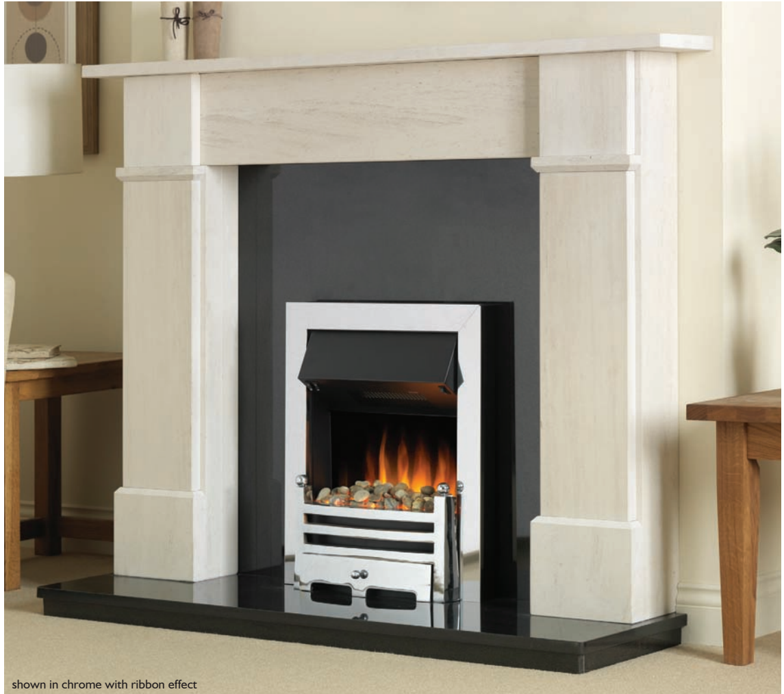
shown in chrome with ribbon effect

for technical specifications please refer to page 43