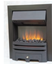
shown in black with ribbon effect

refer to pages 40 - 41 for the full list of options