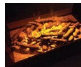
pebbles and logs