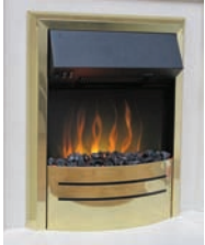
shown in brass with ribbon effect

refer to pages 40 - 41 for the full list of options