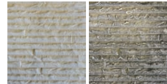
beige tile option

refer to page 41 for the full list of options