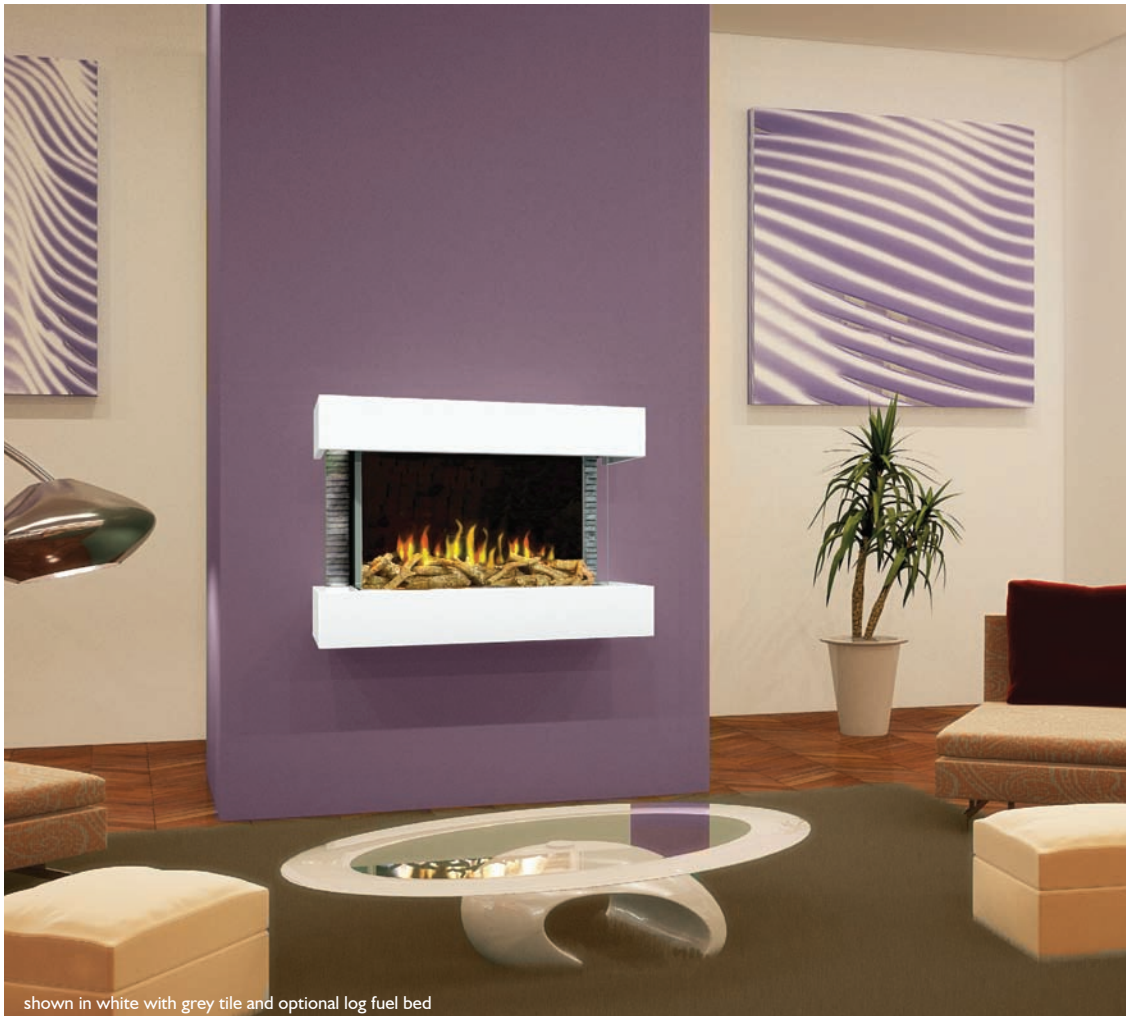
shown in white with grey tile and optional log fuel bed