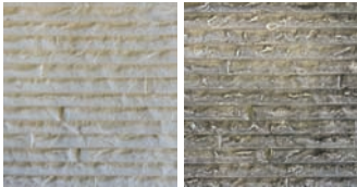
beige tile option

design registration numbers 4024832 - 4035514