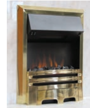
shown in brass with ribbon effect

refer to pages 40 - 41 for the full list of options