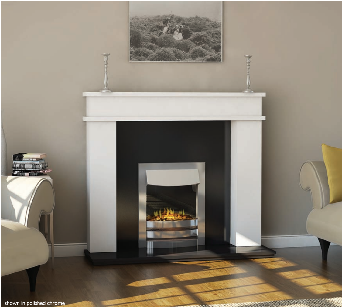
shown in polished chrome