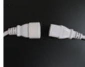
kettle plug connector