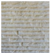
beige tile option

refer to page 41 for the full list of options