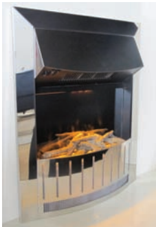
shown in polished chrome

refer to page 41 for the full list of options