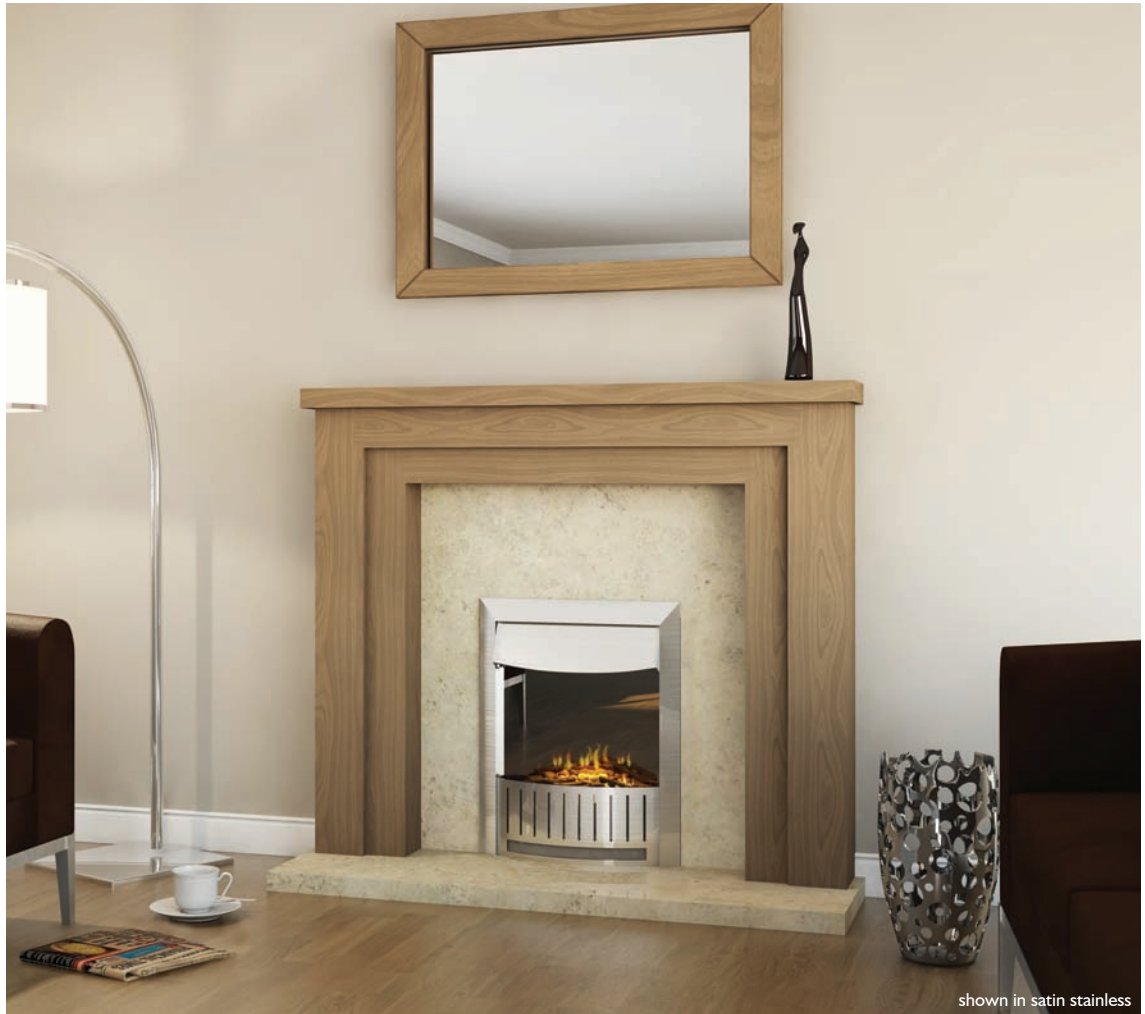
shown in satin stainless

for technical specifications please refer to page 43