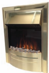
shown in satin brass with ribbon effect

refer to pages 40 - 41 for the full list of options