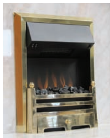
shown in brass with ribbon effect

refer to pages 40 - 41 for the full list of options