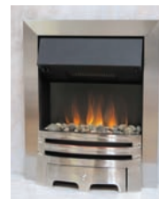
shown in satin stainless with ribbon effect

for technical specifications please refer to page 43