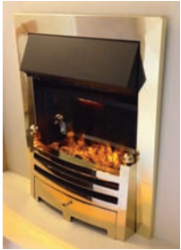
shown in brass with evoflame® effect

refer to pages 40 - 41 for the full list of options