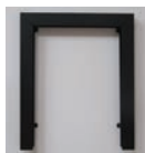
50 or 75mm spacer