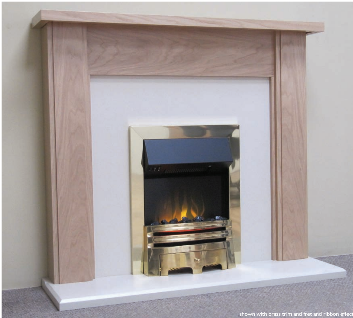
shown with brass trim and fret and ribbon effect