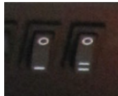
1kW or 2kW heater