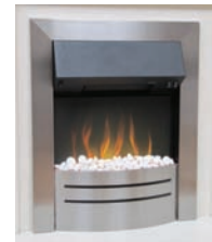
shown in satin stainless with ribbon effect

for technical specifications please refer to page 43