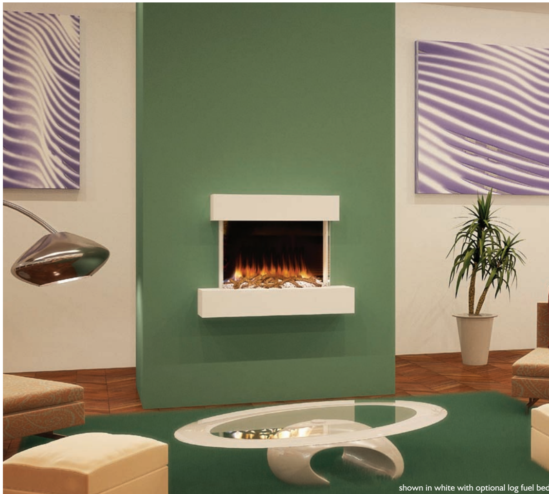
shown in white with optional log fuel bed