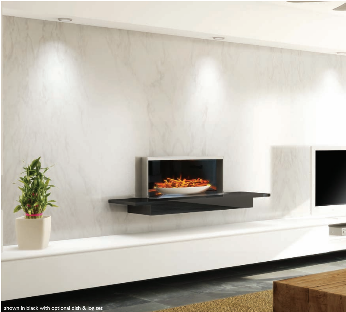
shown in black with optional dish & log set