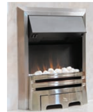
shown in satin stainless with ribbon effect

for technical specifications please refer to page 43