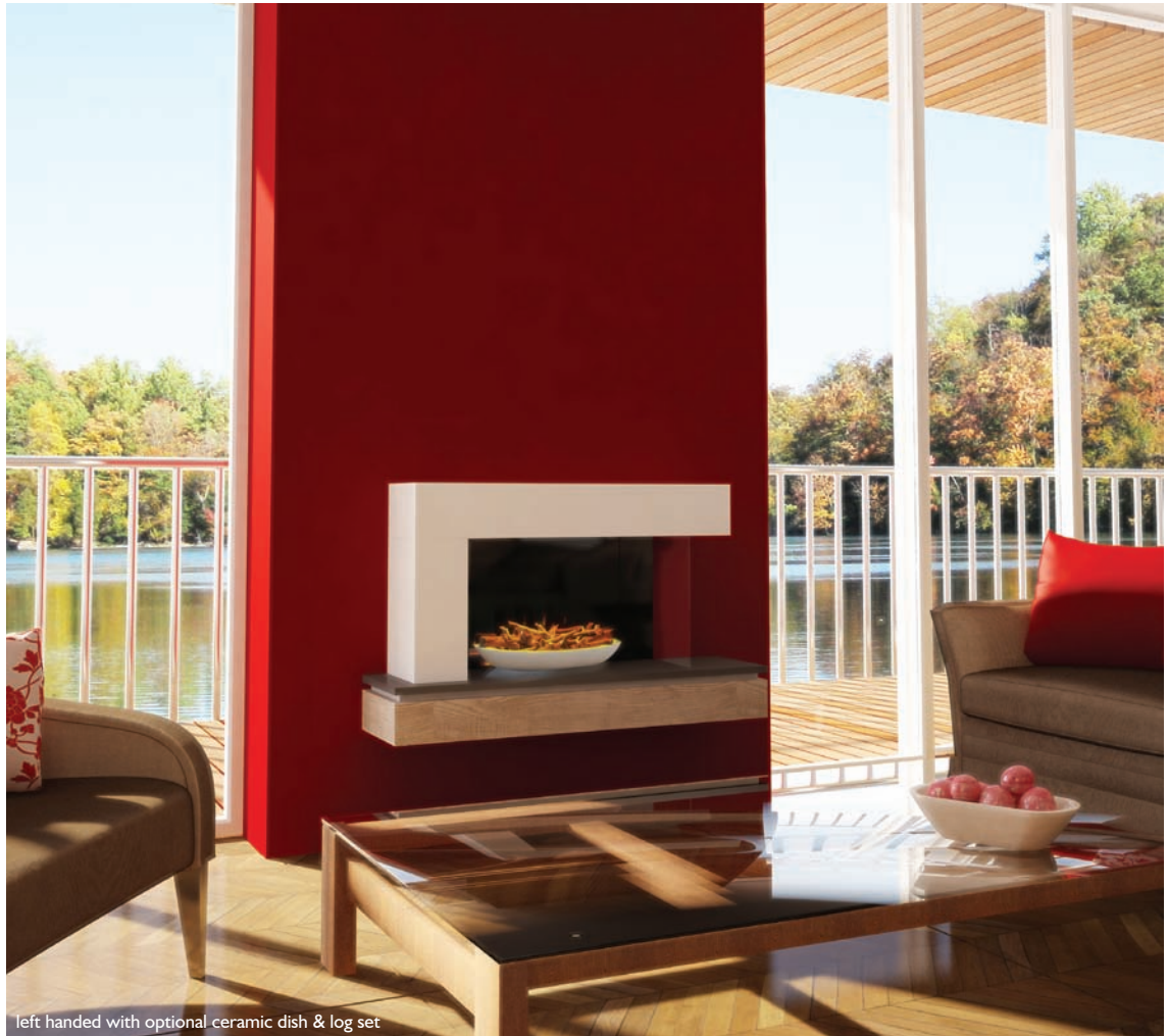
left handed with optional ceramic dish & log set

for technical specifications please refer to page 42