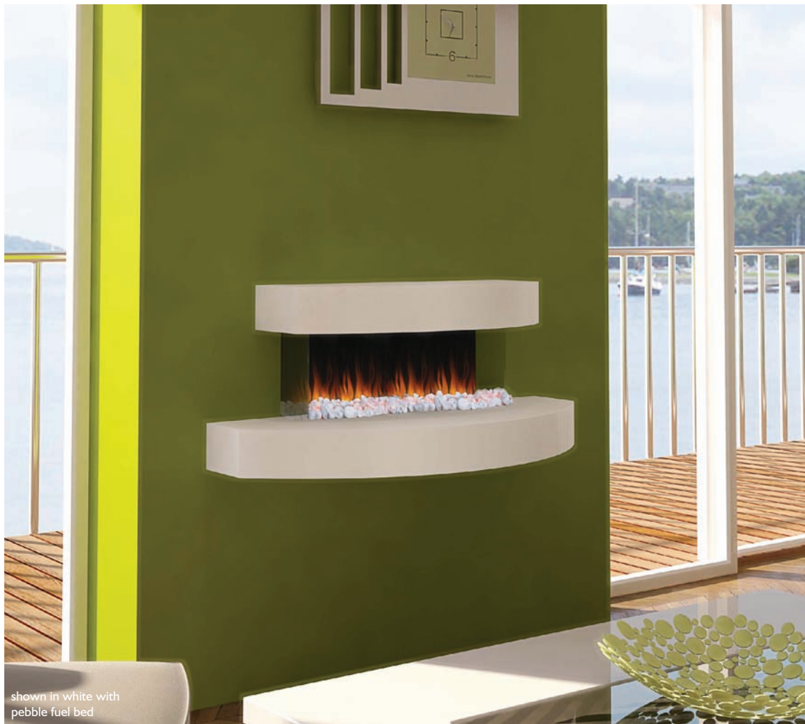
shown in white with pebble fuel bed

refer to page 40 for the full list of options