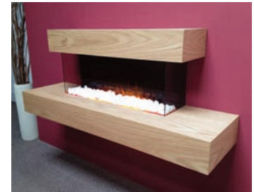
shown in oak with pebble fuel bed

refer to page 40 for the full list of options