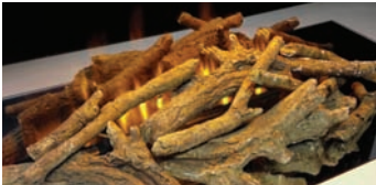
standard log set

design registration numbers 4035512 - 4035514