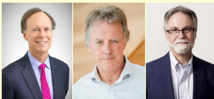
William G. Kaelin Jr

The 2019 Nobel Prize in Physiology or Medicine is awarded jointly to William G. Kaelin Jr , Sir Peter J. Ratcliffe and Gregg L. Semenza "for their discoveries of how cells sense and adapt to oxygen availability." They identified molecular machinery that regulates the activity of genes in response to varying levels of oxygen.