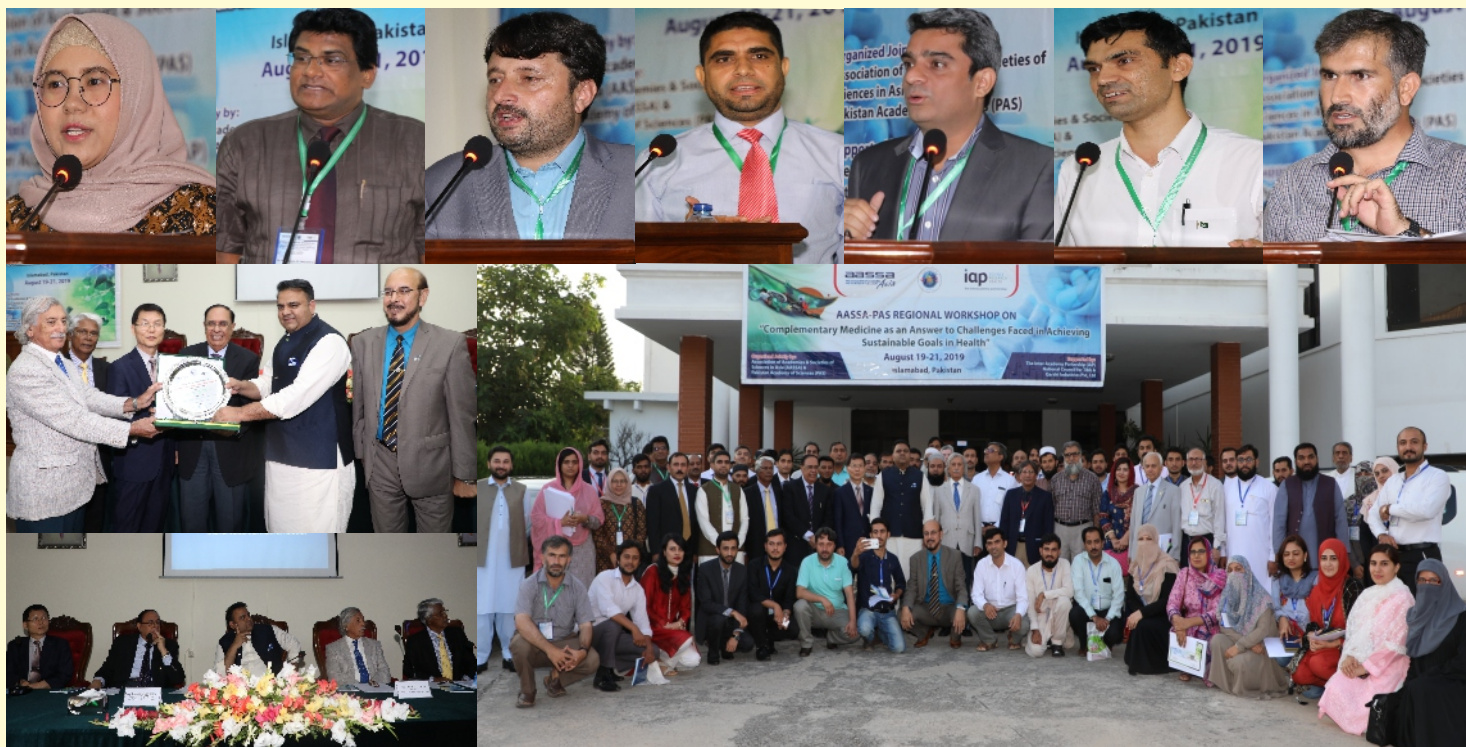
Speakers and Group Photo of participants with Chief Guest Federal Minister S & T, H.E. Chaudhry Fawad Hussain