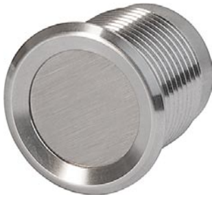
PSE HI 22