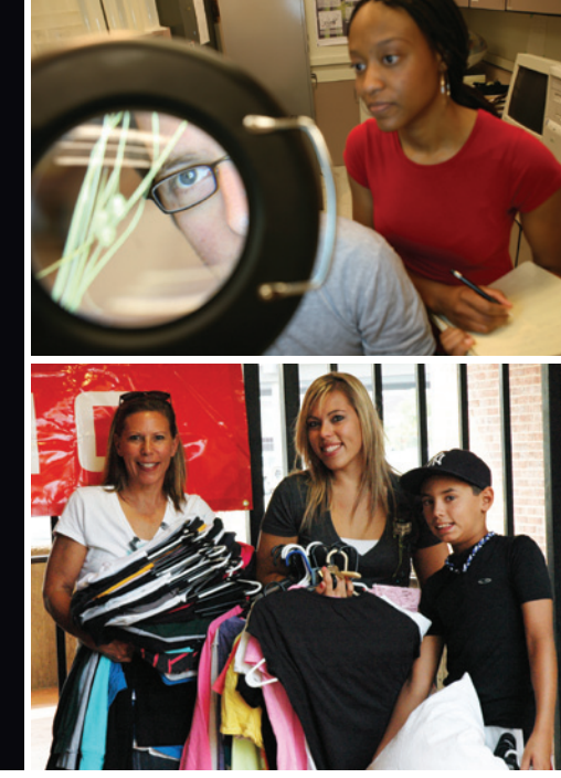
CU students spent $500 million last year, while visitors such as family and friends spent $22.9 million, including costs for hotels and recreation.

In FY 2011, the University of Colorado was the third-largest employer in the state of Colorado, employing 27,500 people directly and another 16,000 people indirectly through its demand for goods and services, as well as construction.