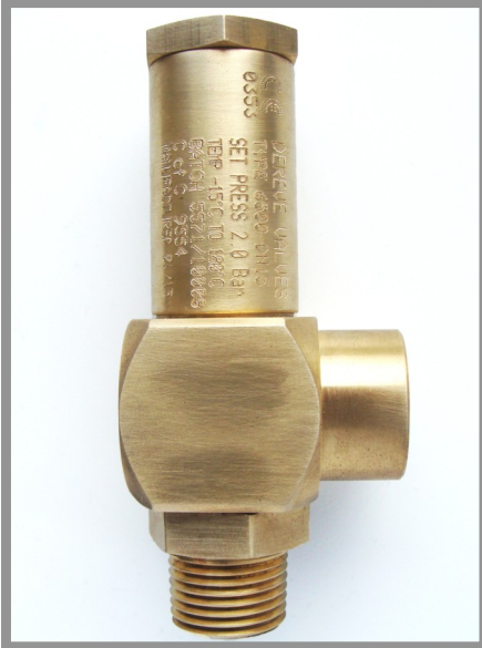
Base appearance may differ between sizes

Valves can be supplied de-greased for oxygen service & lead wire sealed.