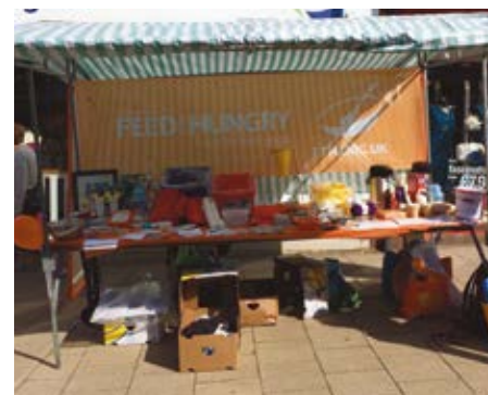
A market stall was set up outside Feed The Hungry's Offices

In addition to this, several schools, colleges and Sunday Children's Groups took part in a Make May