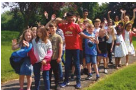
Children taking part in a sponsored walk for Make May Matter

In May 2018, Feed The Hungry UK ran the campaign, 'Make May Matter', following its success in May 2017. It was an exciting month full of activity and community engagement. Make May Matter's aim is to encourage staff and Feed The Hungry supporters to raise