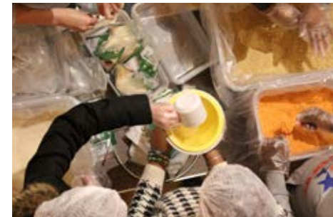
Volunteers pack food at a Hand To Hand event

In the United States and elsewhere in Europe, food packing is fairly well known. In 2017, over 300 million meals were packed in the USA and sent overseas. In the UK, food-packing is relatively new, although is becoming more common, especially in the corporate sector. Feed The Hungry takes food-packing and makes it relevant for churches.