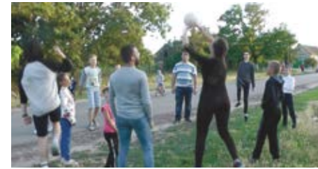
WLW Church meet young people to share with them God's Love and provide practical aid to poor families.

a Welshman sharing with them about a Jesus that cares for them through the parable of the lost sheep.