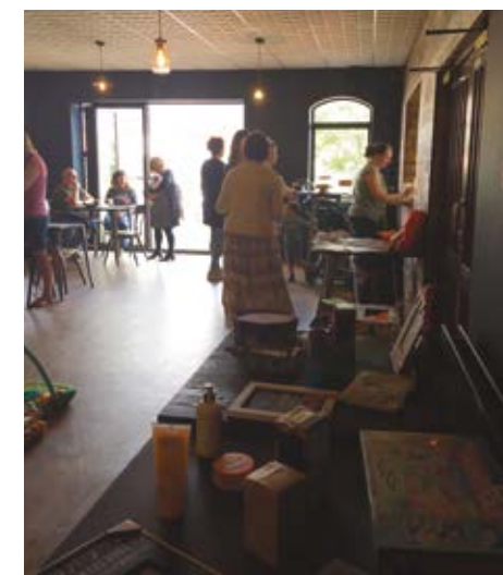
A church holds a raffle and serves tea and coffee.

While the Make May Matter campaign is still small, the community engagement and awareness raised has been profound and continues to grow