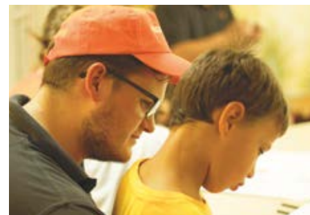
Feed The Hungry staff share in activities with children in a Romanian Orphanage

ality. Romania was still a country gripped by the oppressive hands of poverty. To be fair, the cities had begun to thrive, businesses were growing and, in economic terms, Romania is moving on up. However, the city success doesn't tell the whole story. People in villages and small townships are still struggling to work, to put food on the table, provide for their children, get basic medical support and clean water. As a result, orphanages are still very much a main part of the civic system and reliance on international support is on-going, to ensure the institutions are funded and sustained.