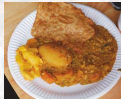
Guests were served a meal of rice, lentils, potatoes, carrots and flat bread.

Feed The Hungry assisted in providing ingredients for the meal as well as finding resources such as plates and forks. We feel very honoured to have been approached to participate in this