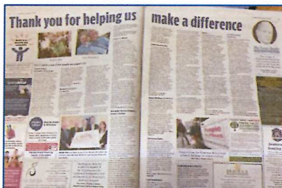
Maidenhead Advertiser, October 2016