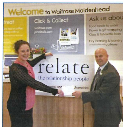
Cheque for £300