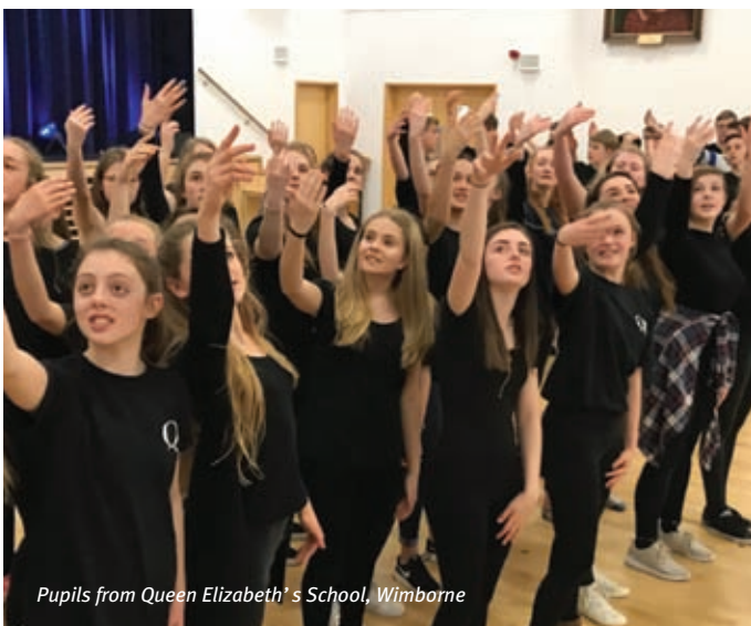
Pupils from Queen Elizabeth's School, Wimborne