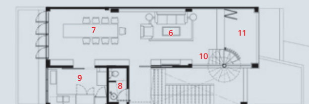
2nd Storey Plan