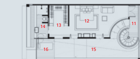
3rd Storey Plan