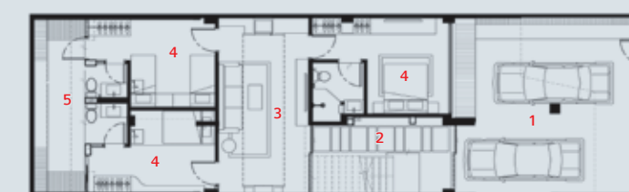
1st Storey Plan

“...A TIMBER ‘CAGE’ SUSPENDED OVER THE MAIN ENTRANCE ATRIUM WITH A GLASS FLOOR...SEXY, PLAYFUL AND INTRIGUING!”