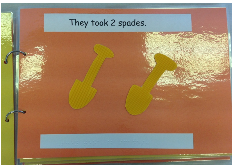
They took 2 spades