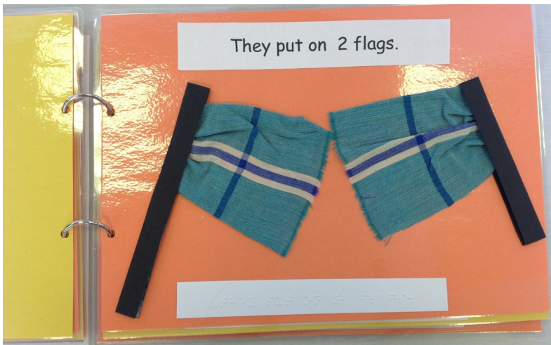
They put on 2 flags