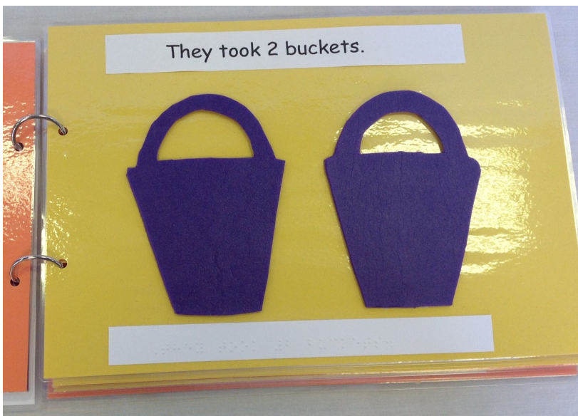
They took 2 buckets