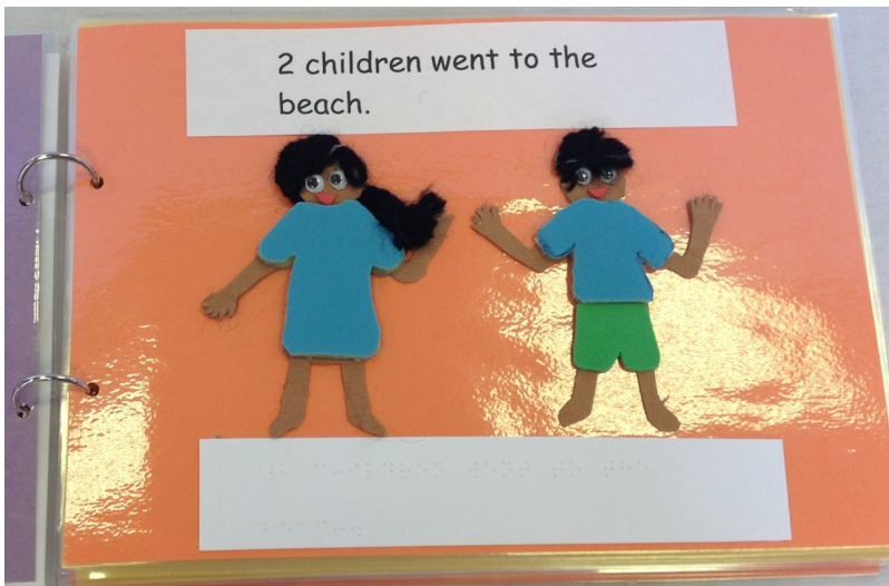
2 children went to the beach