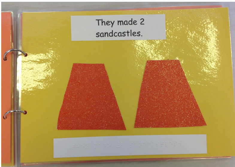
They made 2 sandcastles