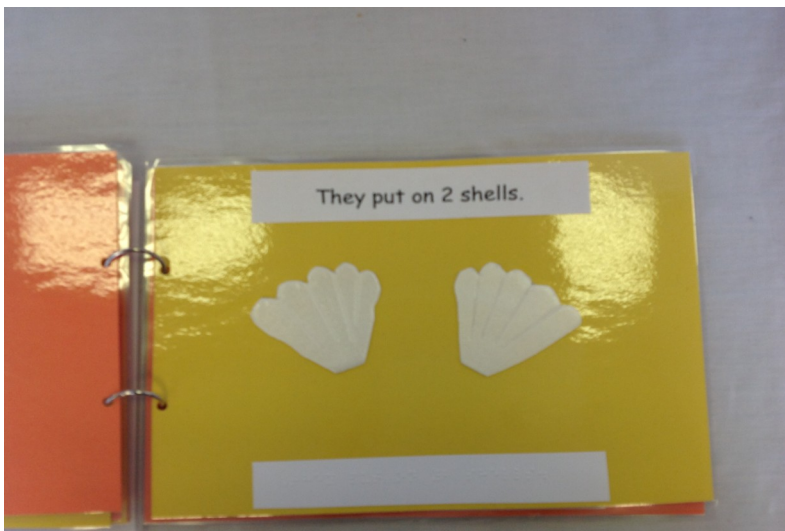
They put on 2 shells